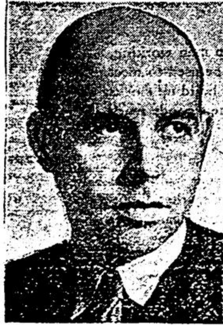
Under-secretary of state for external affairs, Norman A. Robertson, who succeeds Viscount Massey as Canadian high commissioner in London.

When the M.P.'s put the bill through which gave them the exemption on the $2,000 they lost the respect of the Canadian taxpayers, who consider that they have as much right to pay taxes as any other citizen, and that $6,000 is a mighty good salary for the greater number of the 245 members. The Senators should show the M.P.'s an example in good citizenship. —Pembroke Bulletin