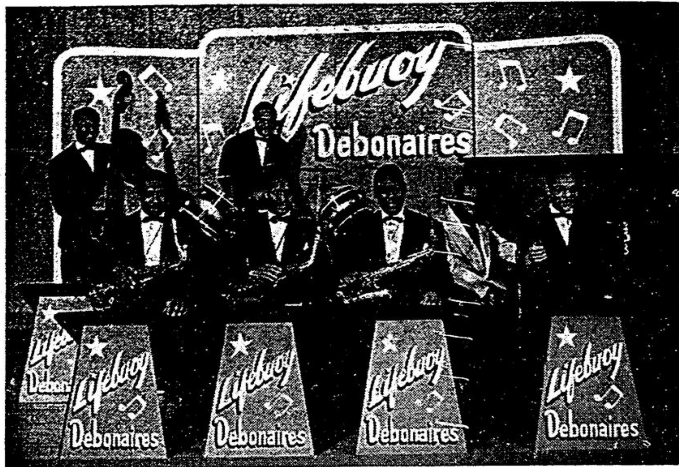
The Lifebuoy Debonaires who will appear at Markham Arena on Saturday evening of this week under the sponsorship of the Markham-Unionville Lions Club. The admission to enjoy a dance to this fine orchestra is one Lifebuoy box along with 35c.