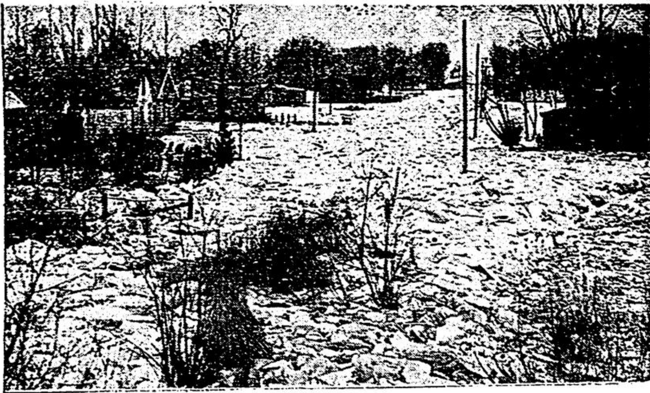
Fifty families were isolated when Etobicoke creek flooded its banks at Long Branch after