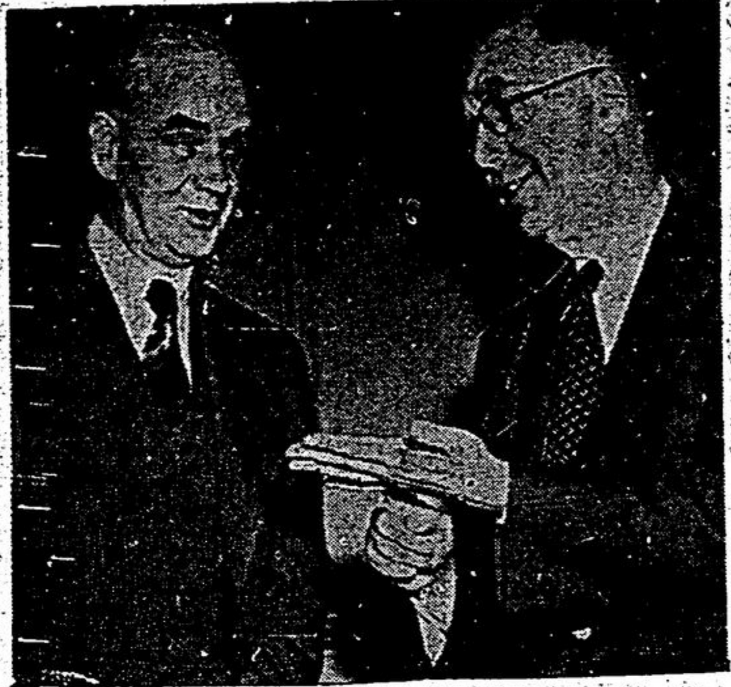
AS LABOR AND MANAGEMENT MEET Philip Murray, left, C.I.O. president is shown in above photo as he confers with Lewis B. Schwellenback, secretary of labor at the labor department in Washington, during a conference between representatives and management.

BUILDERS OF HIGH GRADE FARM IMPLEMENTS SINCE 1847