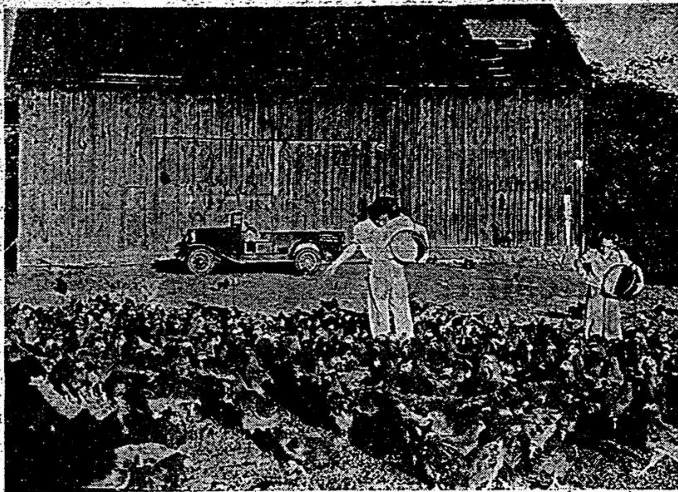
Going to bed with the chickens is almost literally true for a family of four near Hamilton, Ont., who share a barn with 6,000 chickens after buying a farm. Tenants in the house refuse to move. Two members of the family are shown feeding their "bedmates."

ing from Whitevale. This is a worthy cause. Worthy of your supreme support.