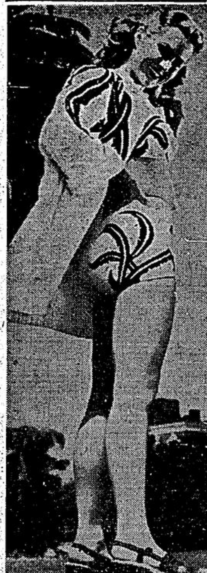
California palm leaves in brown are outlined on this white bathing suit which Virginia Mayo models here.