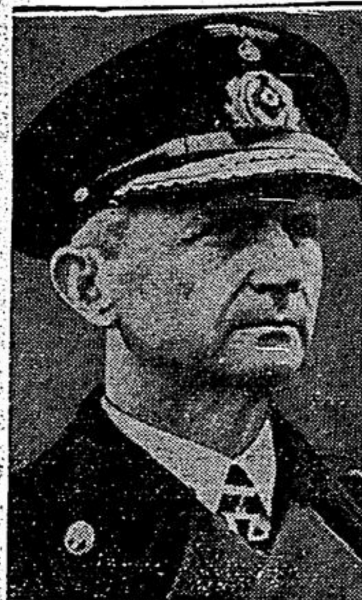
Admiral Doenitz has been proclaimed by the Germans as their new leader after reporting the death of Adolf Hitler. Heinrich Himmler, however, still seems to be strong man of the tattered Nazi party.