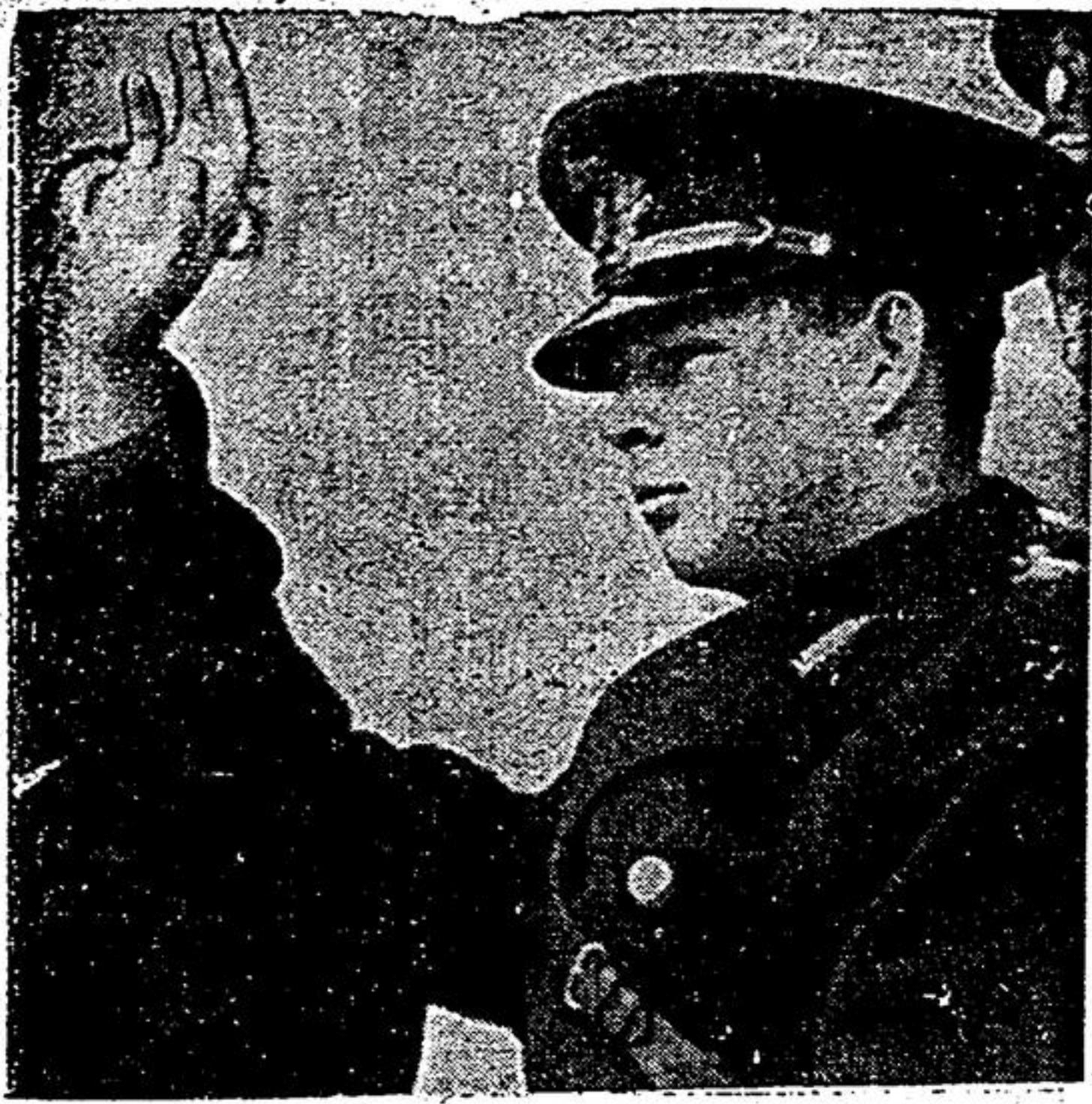
MICHAEL ORDERS WAR WITH NAZIS King Michael, here shown giving the Fascist salute in 1939, has ordered his Romanian armies to cease fire against the Axis and to take up arms with the Russians.