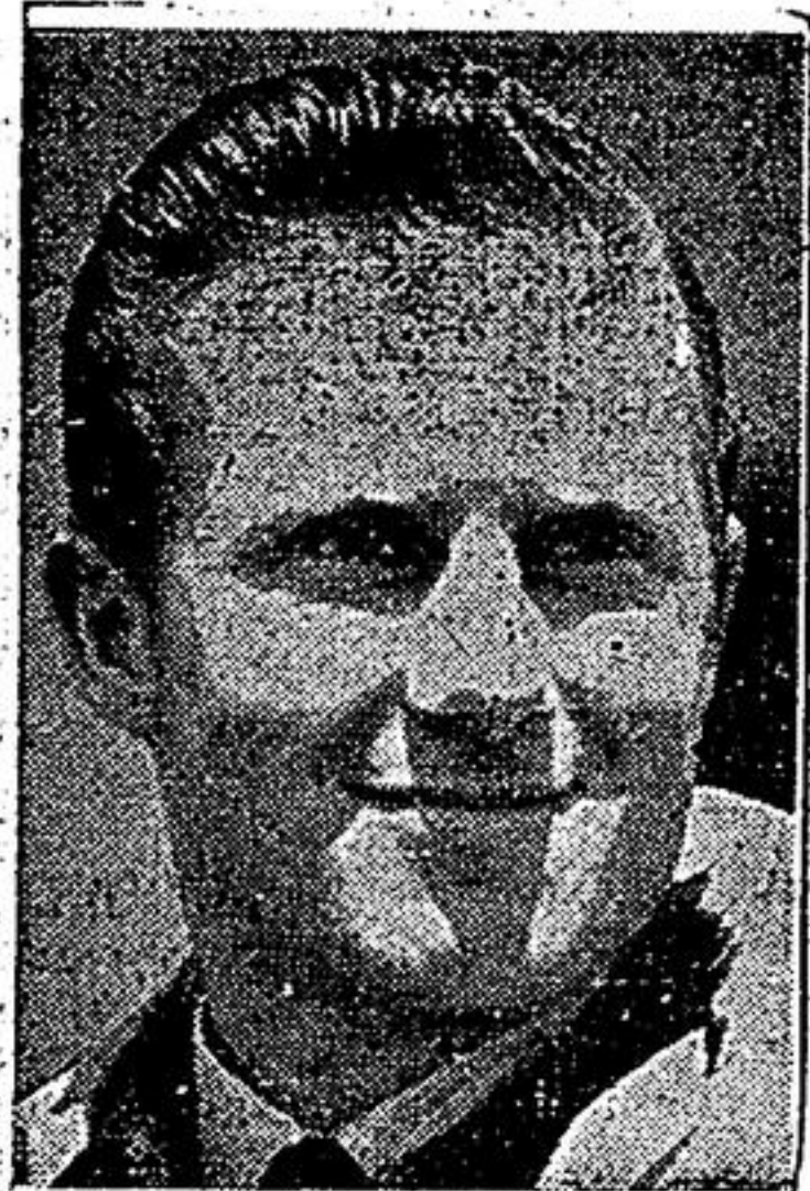
Four enemy aircraft were shot down in one night's hunting by Ft.-Lieut. S.H.R. Cotterill, of Toronto, 24-year-old member of the City of Edmonton Intruder Squadron, while roaming over France the night of June 6, invasion night.