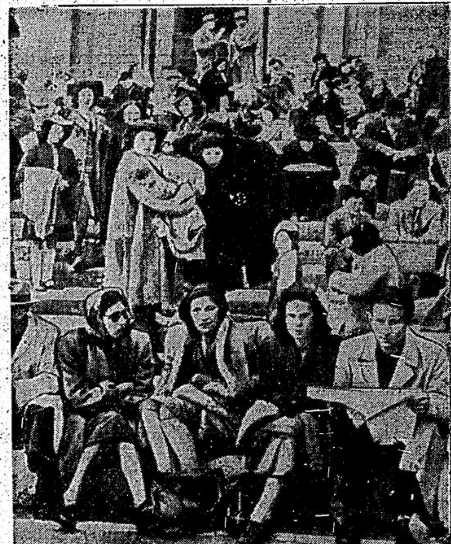
Seeking safety from the battle which threatened a few days ago to engulf their city, citizens of Rome sit and stand in front of St. Peter's cathedral in the Vatican City.