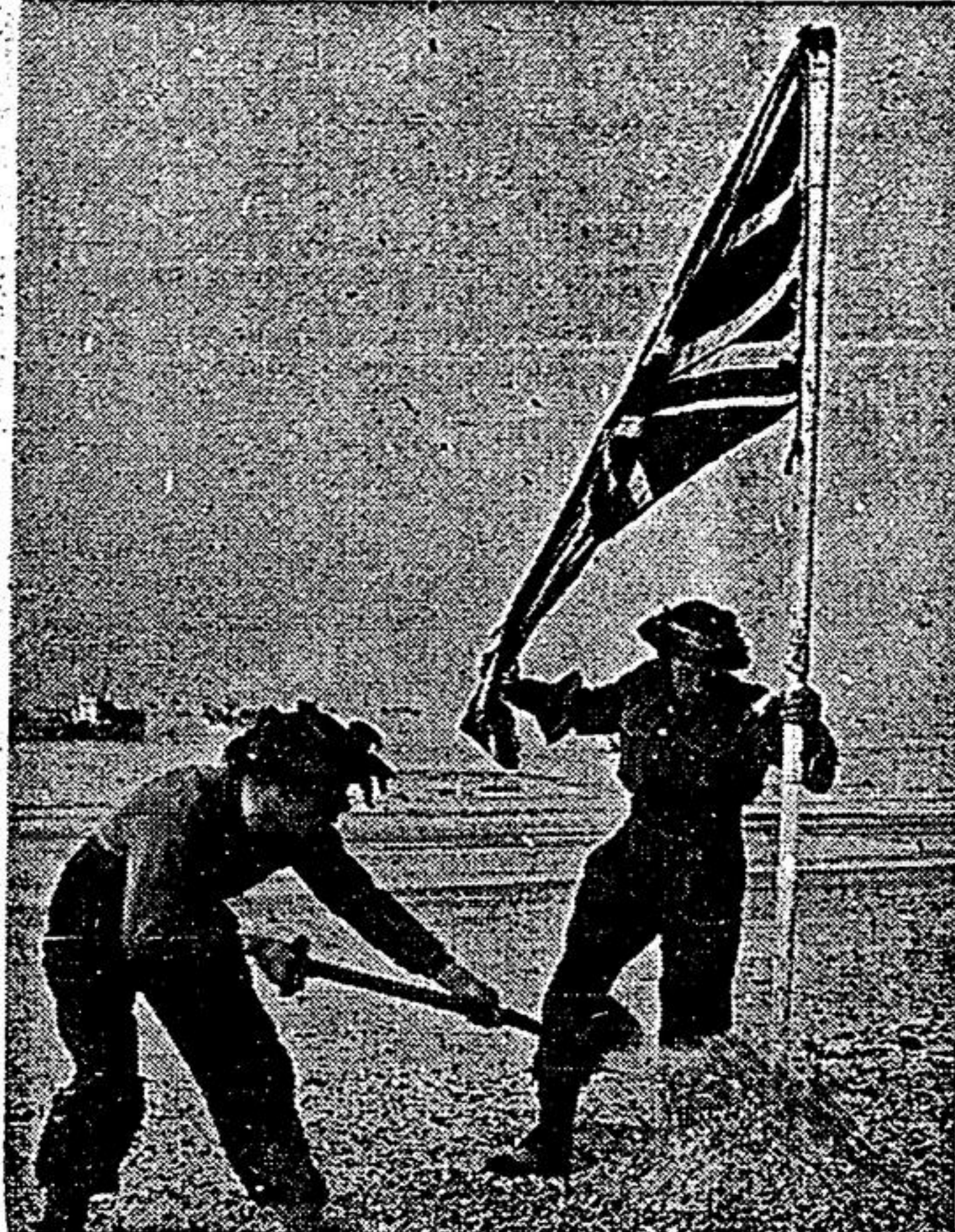
British flag marks beach commanders post on the beaches being stormed in the course of invasion. Photo was made during large-scale operations of the British Army a few weeks before the real thing.