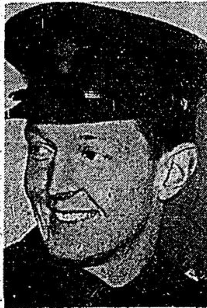
Capt. (Acting Major) William Sidney of the British forces has been awarded the Victoria Cross. He is the son-in-law of Lord Gort, governor of Malta, also a Victoria Cross winner.