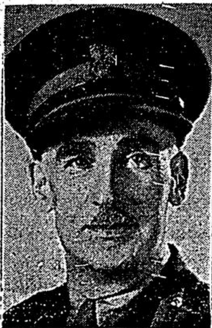
Maj.-Gen. A. E. Nash, 62, who enlisted as a private in the great war with a cavalry unit and was recently named inspector-general of the Canadian army for central Canada, died in hospital in Montreal, June 4. Gen. Nash had been under observation since suffering head injuries during a recent routine inspection tour at Bowmanville, Ont.