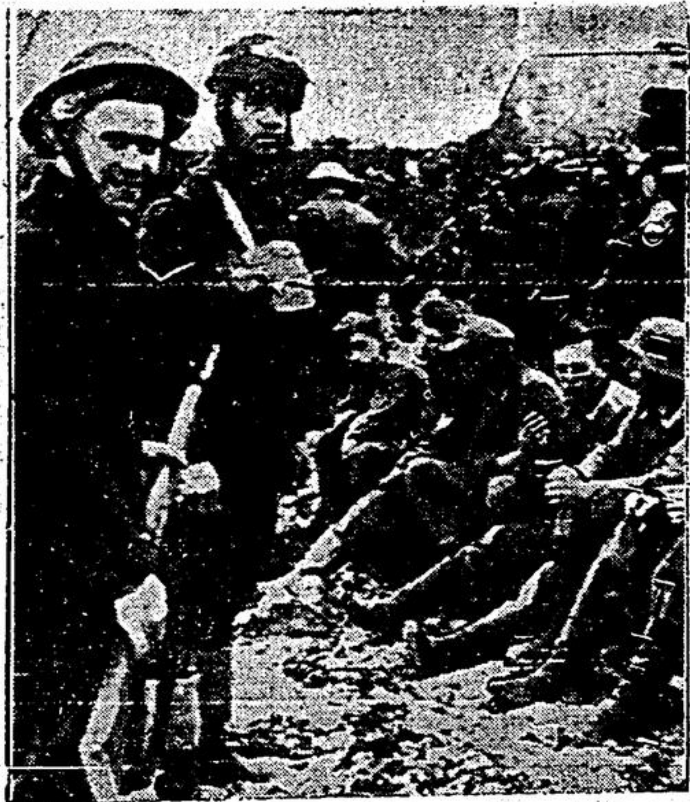
Men of the Canadian invading forces stand guard over the first German prisoners captured by the Allied troops as they stormed ashore on the Normandy coast. Wounded soldiers were being given treatment in the background before being evacuated.