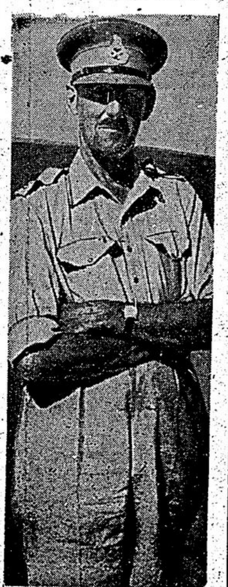
Lieut.-Gen. Sir Oliver Leese is the new commander of the British 8th army fighting in Italy, succeeding Gen. Sir Bernard Montgomery. Gen. Leese, 49, commanded a corps in the 8th army during the march from El Alamein in Egypt to Tunis that drove the Germans from North Africa.