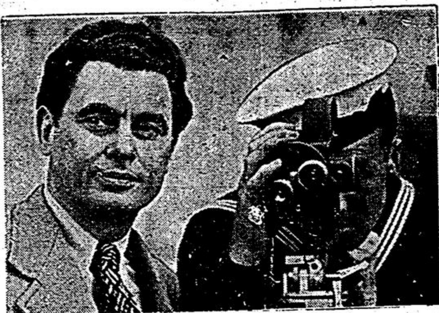
Joris Ivens, director and producer of documentary motion pictures shown here with a naval cameraman, is now engaged in making a film of the Royal Canadian Navy.