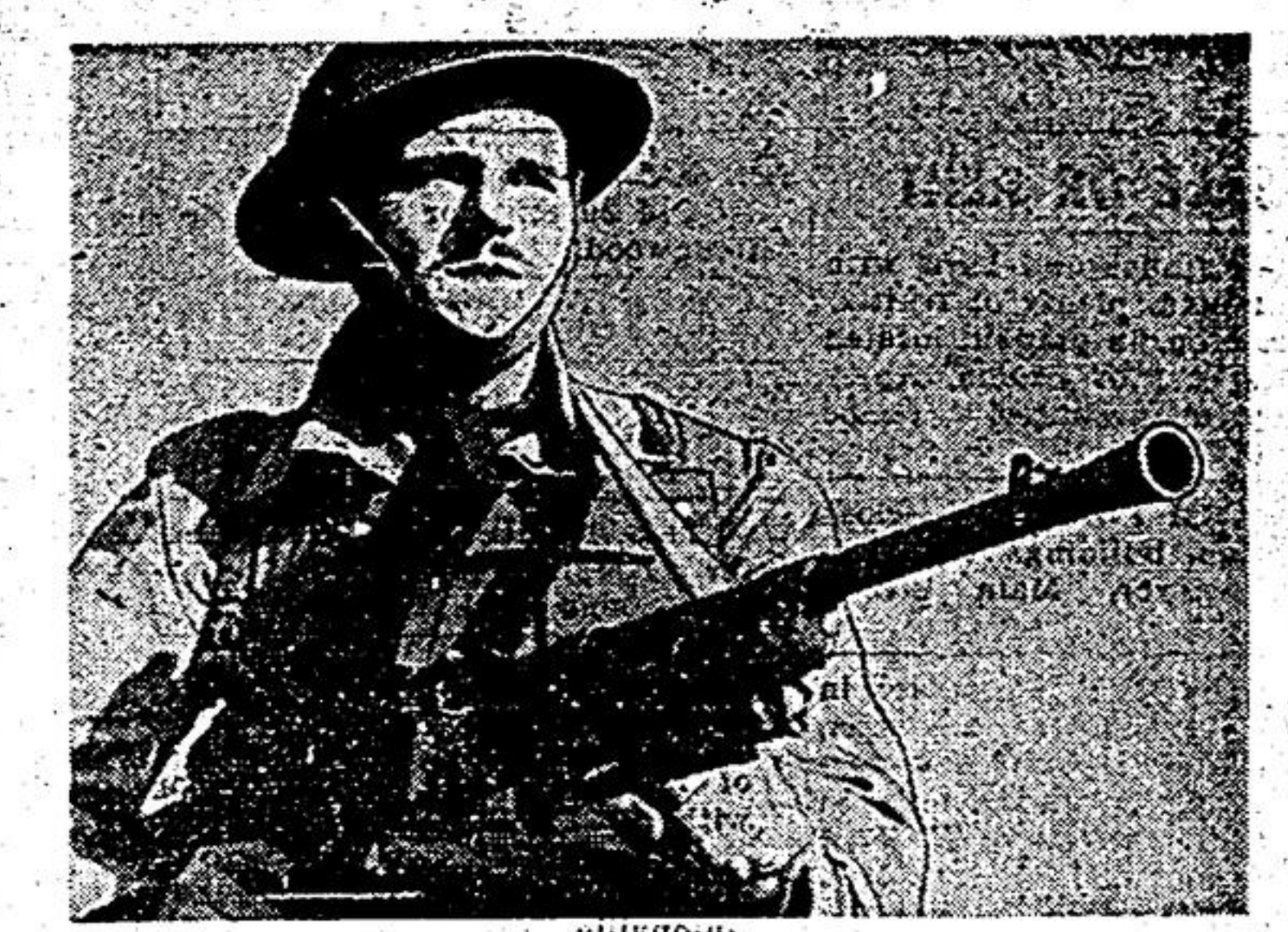
Small arms such as the famous Bren light machine gun produced in quantity in Canadian plants make the Canadian soldier one of the best-equipped fighting men on any front. Trained to a hair, and armed with such modern weapons, he is a match for the finest fighting men on earth.