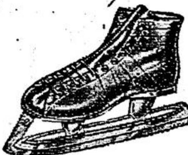
Skate Outfits $3.99