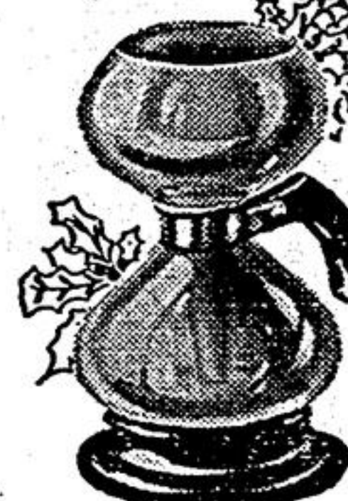
Coffee Makers $6.15