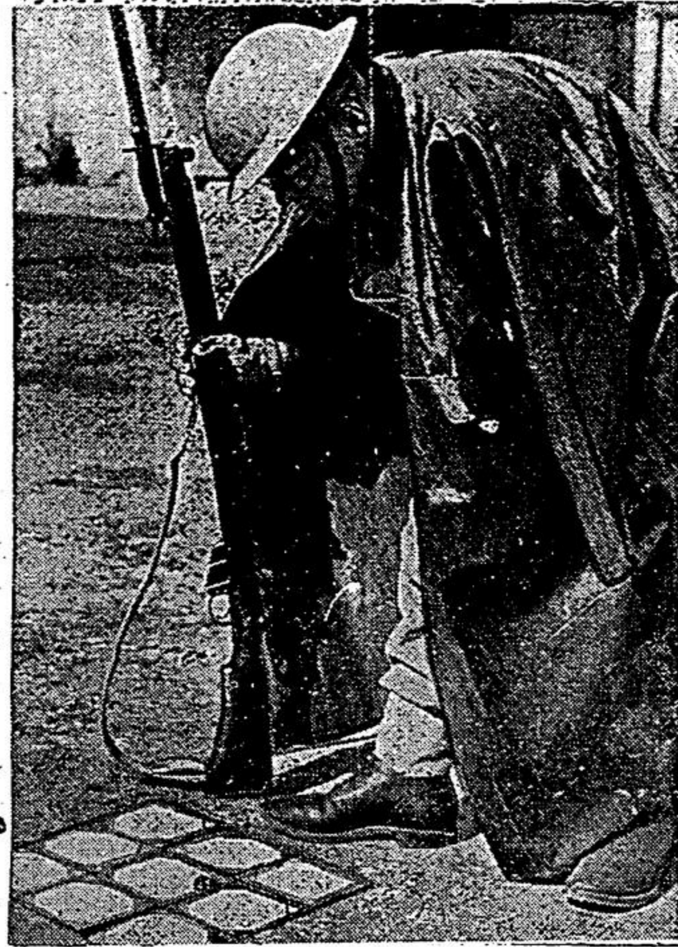
CANADIAN TROOPS LEARN TO COMBAT GAS

This "pathway" machine (left) is one of the wrinkles developed to combat the menace of gas in modern warfare. Troops training at Ottawa, covered from head to foot with