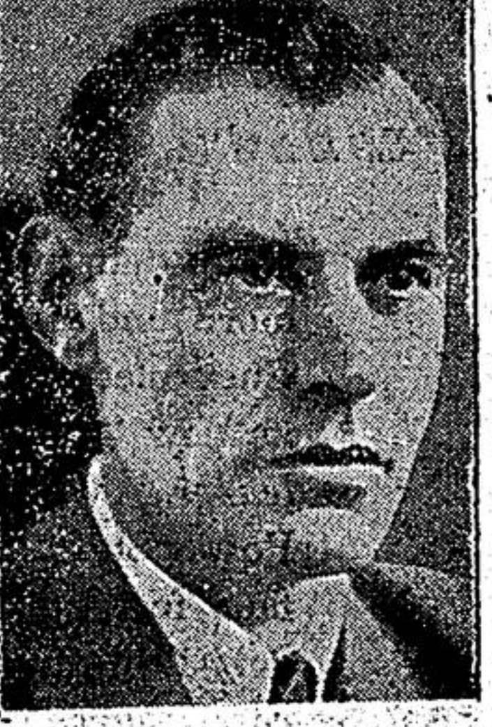
"TELL THE MISSUS"

Canadian soldiers accidentally fired a tear gas bomb at Oliver Stanley, war secretary, and their own staff officer, during an inspection of the Canadian troops. A unit of the Canadian expeditionary force was being trained in the construction of trenches under a gas attack. The officer in command, not noticing the arrival of the war secretary, fired off a tear gas bomb. Stanley was not carrying a gas mask. The war secretary and his escort were caught in the gas.