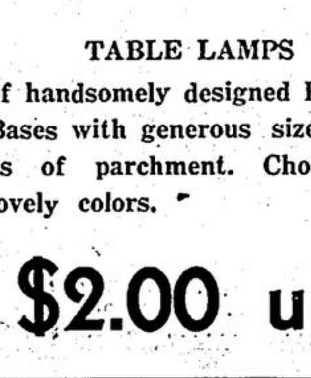
TABLE LAMPS of handsomely designed Pottery Bases with generous size shades of parchment. Choice of lovely colors.

BEAUTIFUL FLOOR LAMPS make wonderful gifts, and their low prices will make them especially attractive to Christmas budgeteers. Gracefully fluted shafts and handsomely designed bases. Complete with shade. $8.50 up to $18.00.