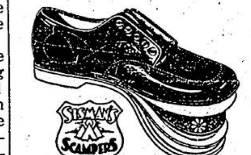
For all the family