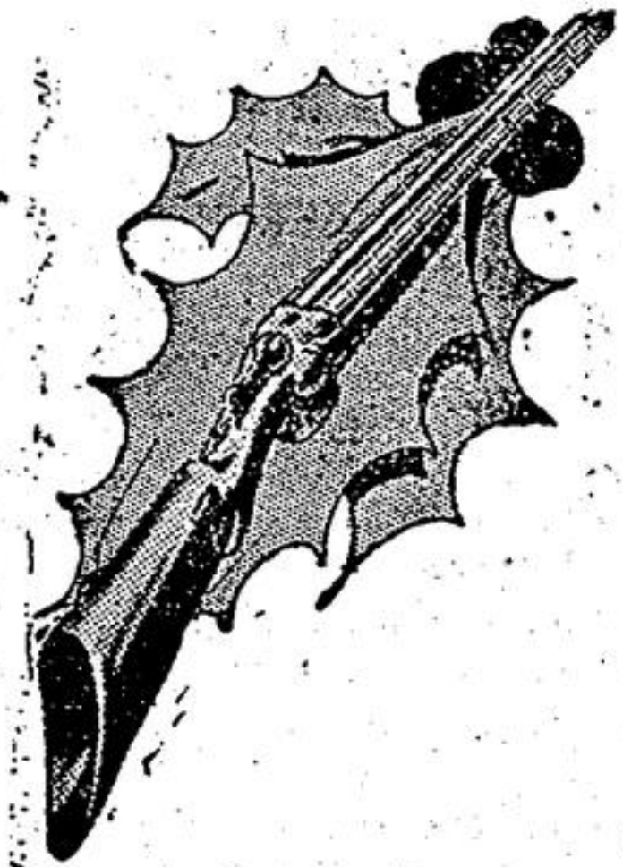
FOR THE HUNTER

How about a new Rifle or Shotgun. Our stock includes those of the country's finest makes.