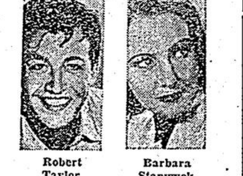
Robert Taylor Barbara Stanwyck far viflor to the broadcasts, two chairs are placed in this spot every week.

When Robert Taylor isn't actually before the microphone during the "Good News" program, he is sitting just off-stage talking to Barbara Stanwyck. Since she has become a regular