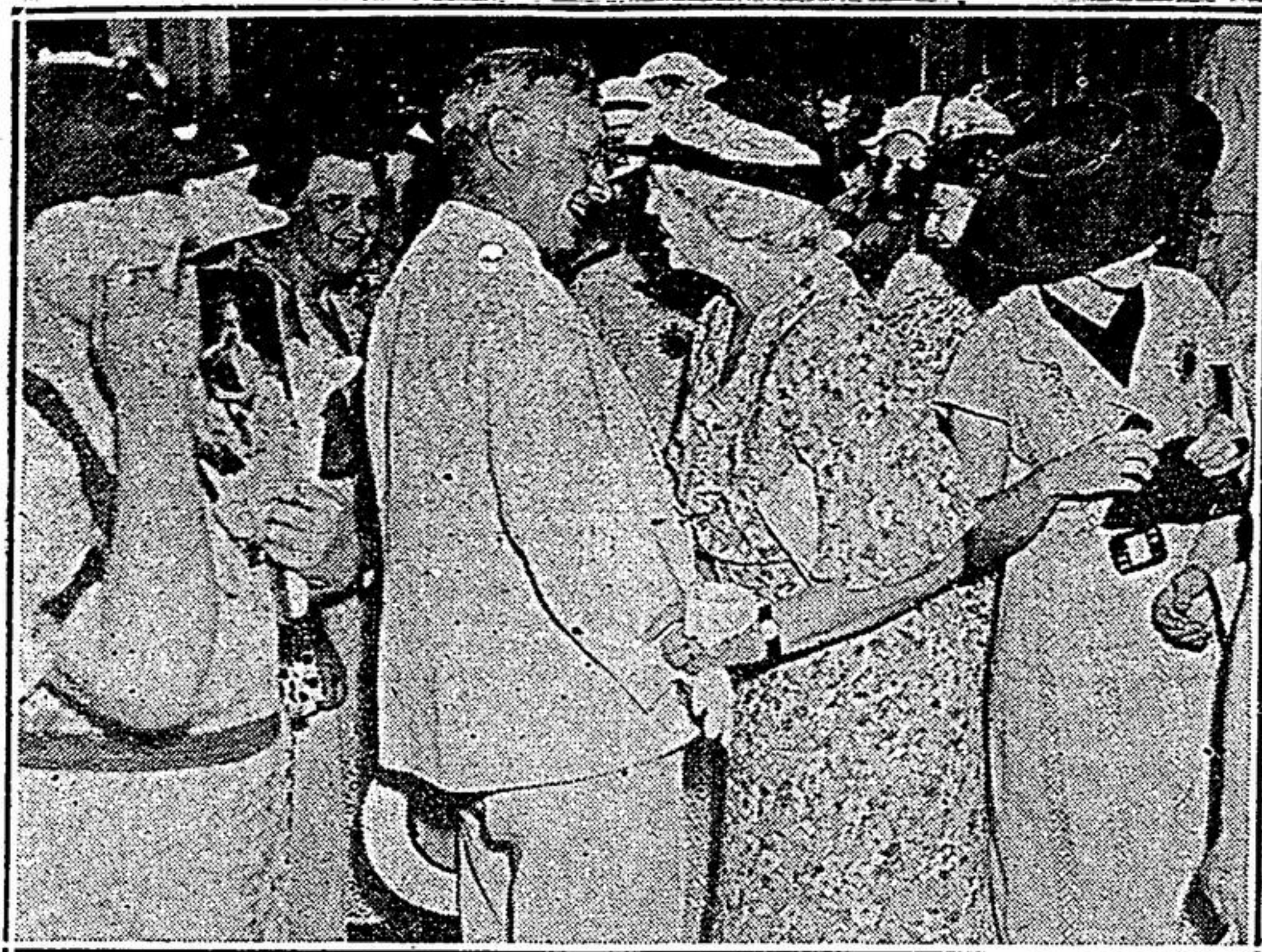
Going back to his home town, Independence, Kan., for first time since his nomination, Governor Alfred M. Landon is enthusiastically greeted by his women neighbors at luncheon in his honor.