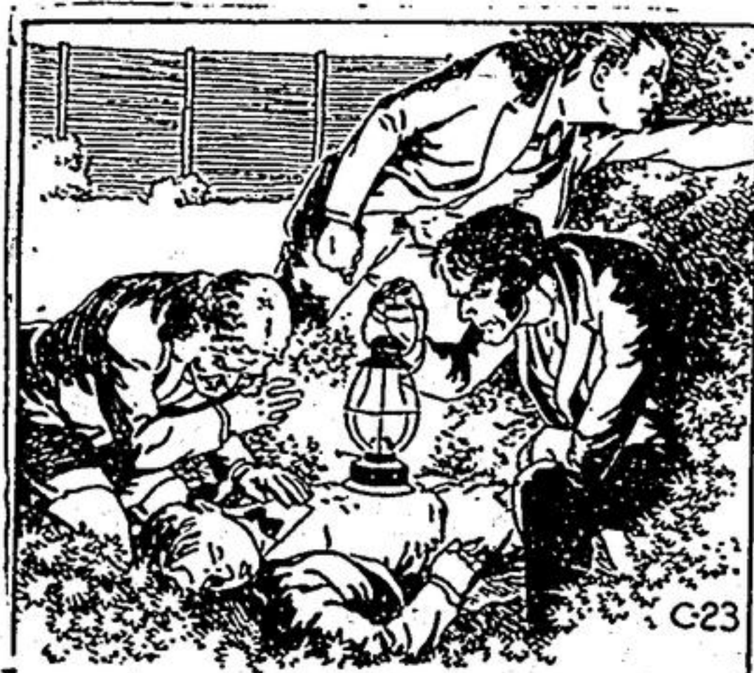
Etham joined us, uttered one short, dry sob, and dropped upon his knees. Donby had not been there just a little while before. How he came to be there now we dared not guess. Fu Manchou I felt my flesh creep.