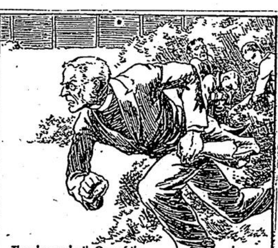
The plan worked! One of the alarm bells connected with points along the fence began ringing madly inside the house. "Wait!" commanded Etham, and dashed inside.