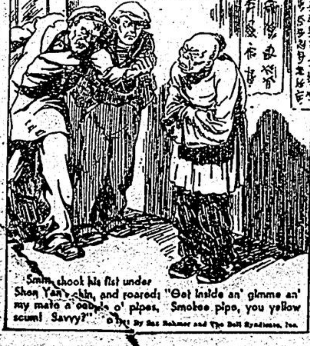
Smith shook his fist under Shen Yan's chin, and roared: "Get inside an' gimme an' my main a' cobbles o' pipes. Smoke pipe, you yellow scound! Savvy?"