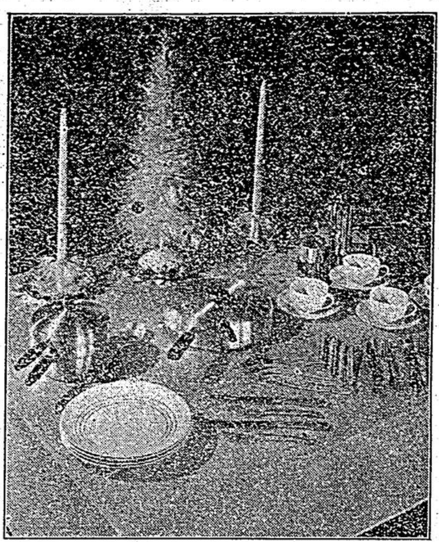
Here is a novelty in table decoration for the festive season. Between the tall white tapers is a modernistic Christmas tree of crushed "Cellophane". The cloth is as modern as the decorations. It is of silk "Cellophane" and rayon.