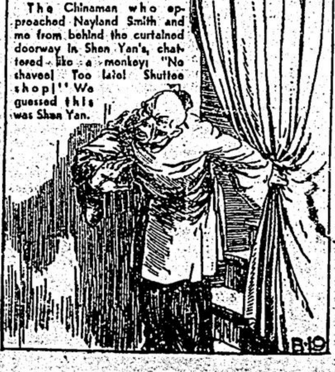
The Chinaman who approached Nayland Smith and me from behind the curtained doorway in Shen Yan's, chattered like a monkey. "No chance! For Lalol Skuttee shop!" We guessed this was Shen Yan.