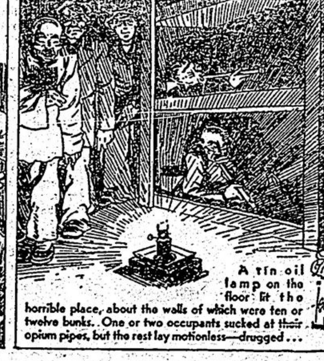
A tin oil lamp on the floor lit the horrible place, about the walls of which were ten or twelve bunks. One or two occupants sucked at their opium pipes, but the rest lay motionless—drugged...