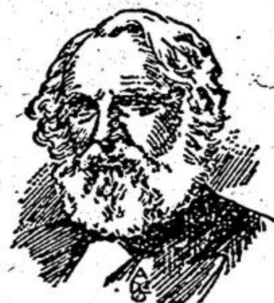
HENRY WADSWORTH LONGFELLOW

Lives of great men all remind us We can make our lives sublime, And departing leave behind us Footprints on the sands of time. TIME has proven our service of tribute—a record of honorable accomplishments. To acquit ourselves with honor is our creed.