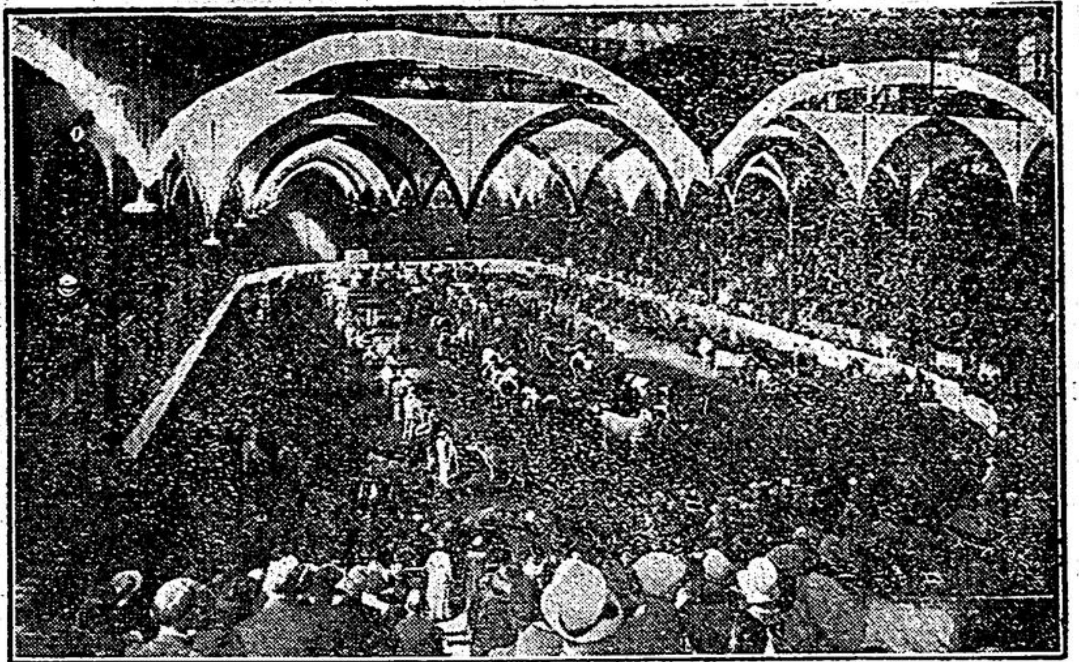
Parade of Cattle—Coliseum Arena.

At The Canadian National Exhibition or Your Nearest Rogers-Majestic Dealer See Rogers Radio Majestic Radio New "300 series" with advanced features including twin speakers and fully guaranteed Rogers Tubes. Latest models with Synchro-Silent Tuning and the remarkable spray-shielded tubes. Majestic Electric Refrigerator with the rotary-pendulum type compressor with only three moving parts. ROGERS - MAJESTIC CORPORATION LTD. Bring this advertisement to booths 94A located on Toronto's beautiful Lake Process Building, or 174-176 Electrical Building and receive a special souvenir. Shore Road near Exhibition Grounds.