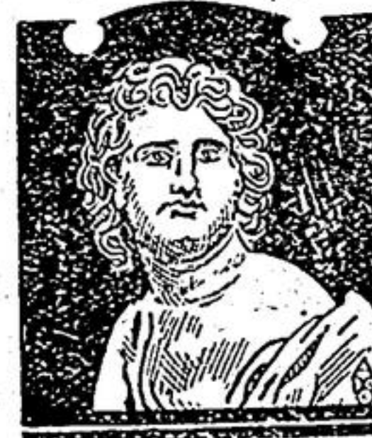
ALEXANDER THE GREAT