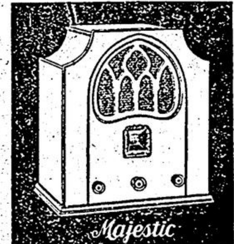
HAVENWOOD MODEL Manitowish model of Georgian design, 5-tube Super-heterodyne Chassis with Spray-Shield and Pentode Tubes. Modulated circuit, variable tone control, full dynamic speaker. Complete with Rogers Guaranteed Tubes. $69

Five tubes actually do the work of seven and do it more efficiently in these new Majestic Models. The "224" tube acts both as oscillator and detector—a new double function never before introduced in a radio set—thereby eliminating one tube. The new "247" tube has a power output equal to two ordinary "245" tubes—thus eliminating another tube. Saving these two tubes saves dollars for you!