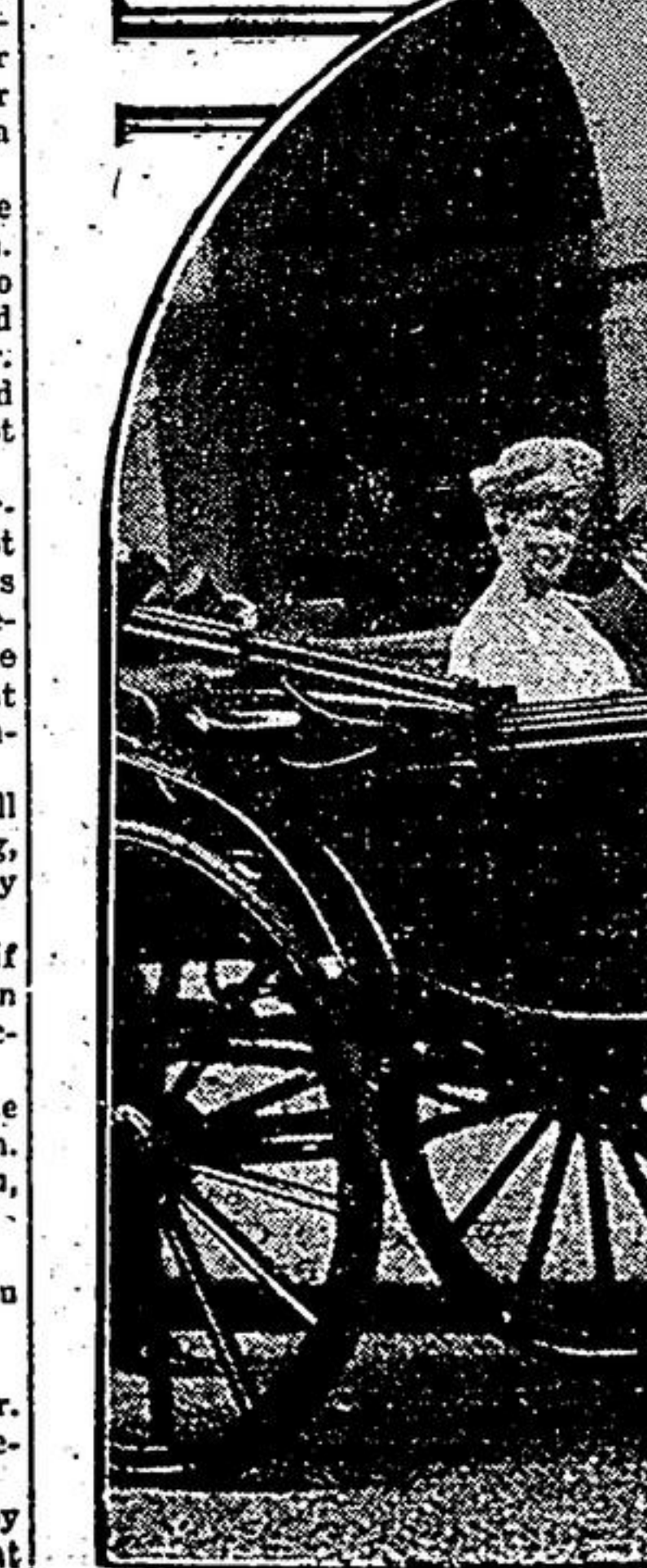
King and Queen, as they appeared, returning from ceremony, when the former opened India House, Aldwych, recently. Their majesties were received upon arrival by Sir Atul Chatterjee, high commissioner for India.