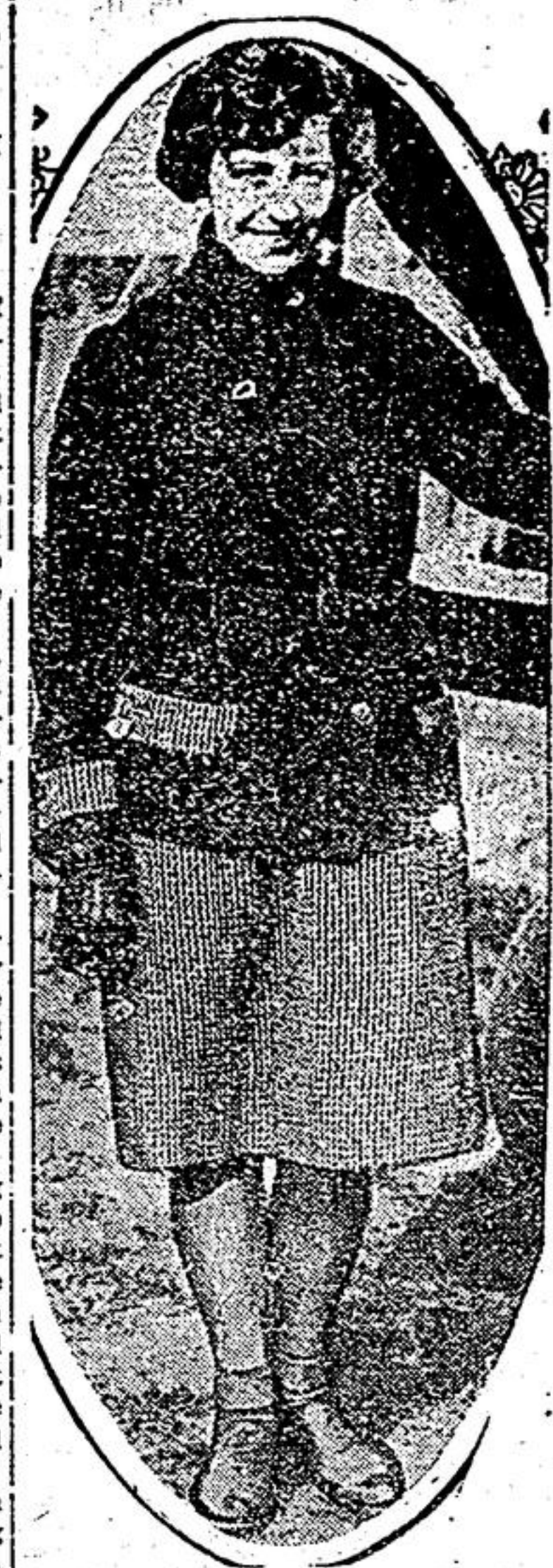
Above photograph shows English aviatrix smiling her triumph over many hardships. Amy Johnson has just completed lone flight from England to Australia where she received congratulatory message from the King.