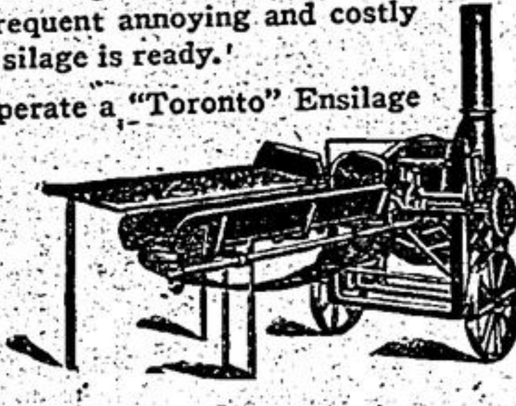
TORONTO ENSILAGE CUTTER

It costs but a fraction to operate a "Toronto" Ensilage Cutter compared to hiring a customs outfit. Again, it enables you to refill after shrinkage—cuts your straw in winter. It quickly pays for itself.