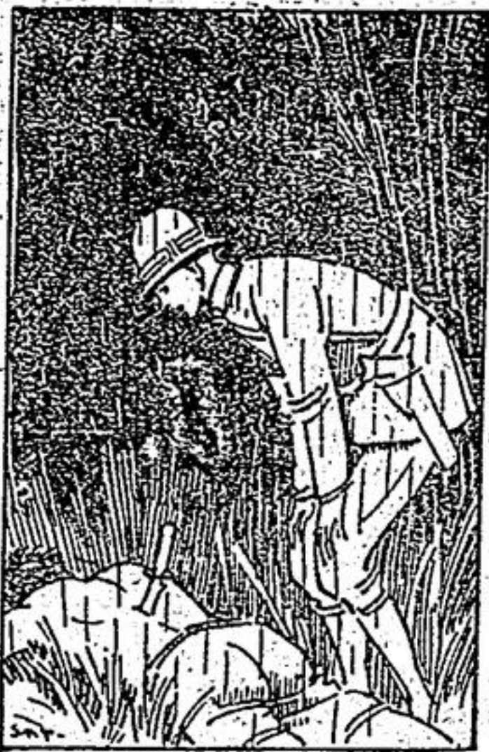
He found Clay stooping over a prostrate form.

"Well, when I left you I walked straight to where I'd left my kit. The orderly had fixed up my tent and laid out my bed. It's a sleepin' bag, y'know, and he's never quite got the hang of it. I turned back the cover to see what he'd done—and there was this underneath."