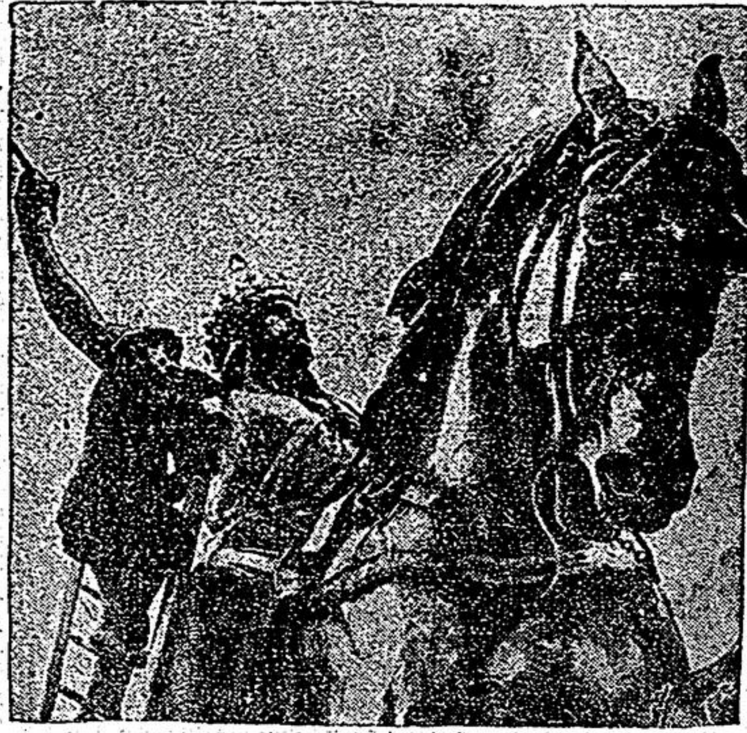
GIVING THE KING BACK HIS SWORD

The famous statue of Richard Coeur de Lion in London lost its sword as a result of the recent hurricane.