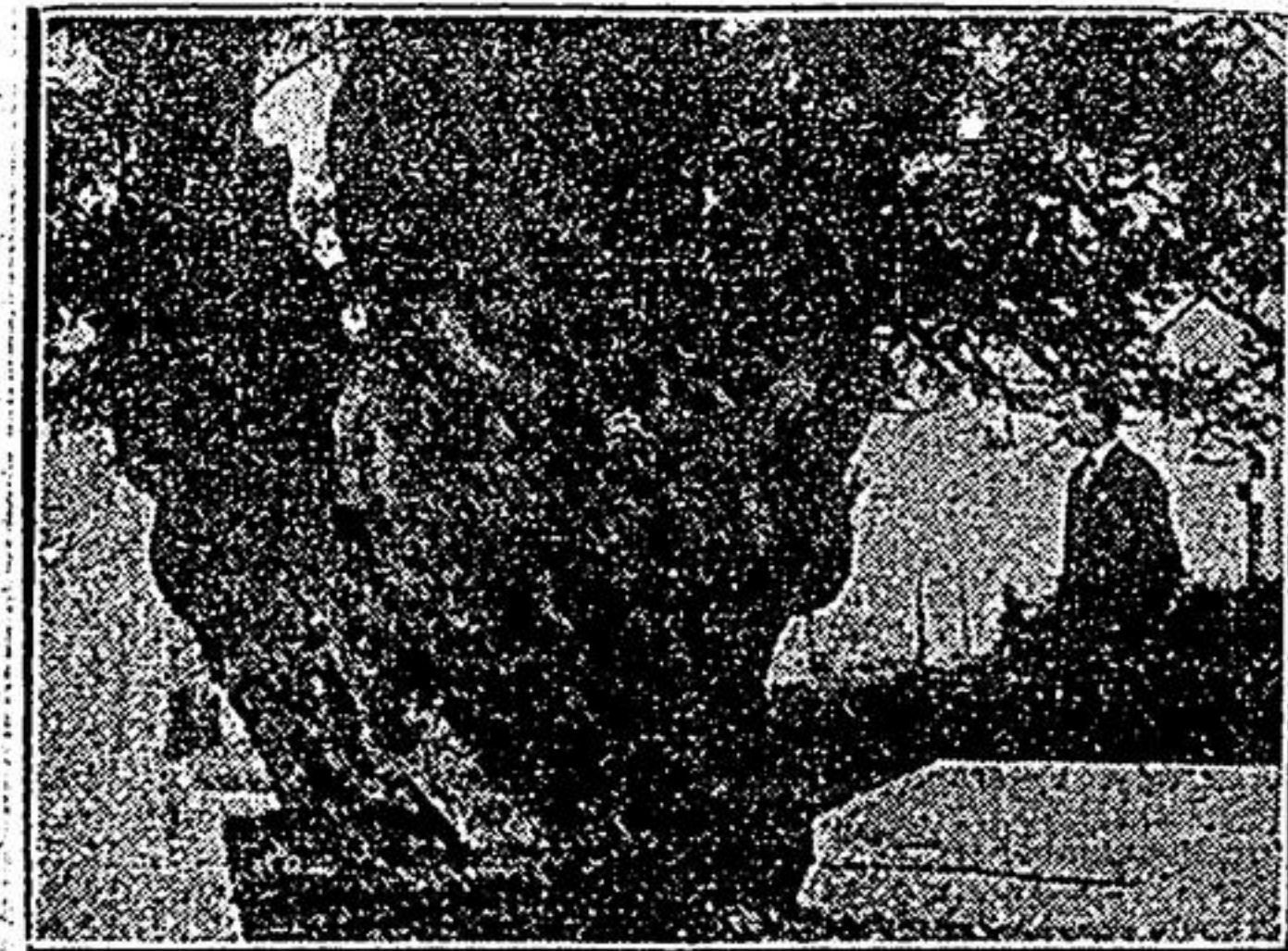
SURGERY SAVED LIFE OF 1,000-YEAR-OLD TREE Giant yew-tree in the churchyard at Warbling, Hampshire, was in danger of dying, but the tree surgeons saved it.

New York World: (The United States Supreme Court has upheld a New York decision making it compulsory for the K. K. K. to file their constitution, oaths and lists of membership). Secrecy has always and almost everywhere been the essence of the Klan's strength; the value of secrecy explains why it has fought this case up to the Supreme Court. The Klan's decay and the decay of secrecy have gone hand in hand. In various States where it has been most dangerous, such as Indiana, Georgia, Pennsylvania and Alabama, legislation has been passed or vigorously pushed to compel it to unmask. Education, enlightenment, the disillusionment of multitudes of dupes, have robbed the Klan of its strength. The best safeguard against the resurgence of any such body is simply strong light.