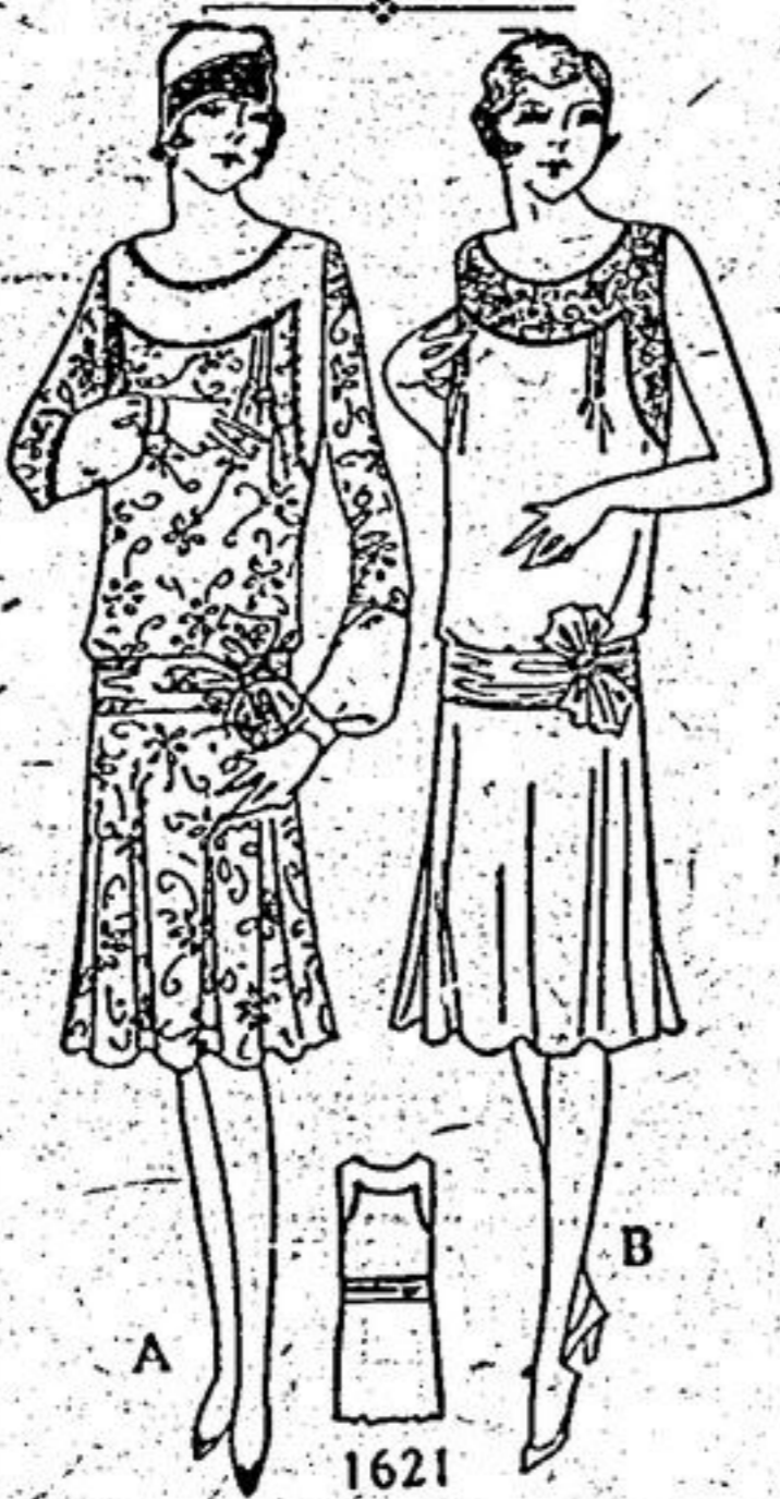
Yokes and Flares Are Smart—This Season

The rest of the chapter describes the way in which Paul asserts his rights as a Roman citizen.