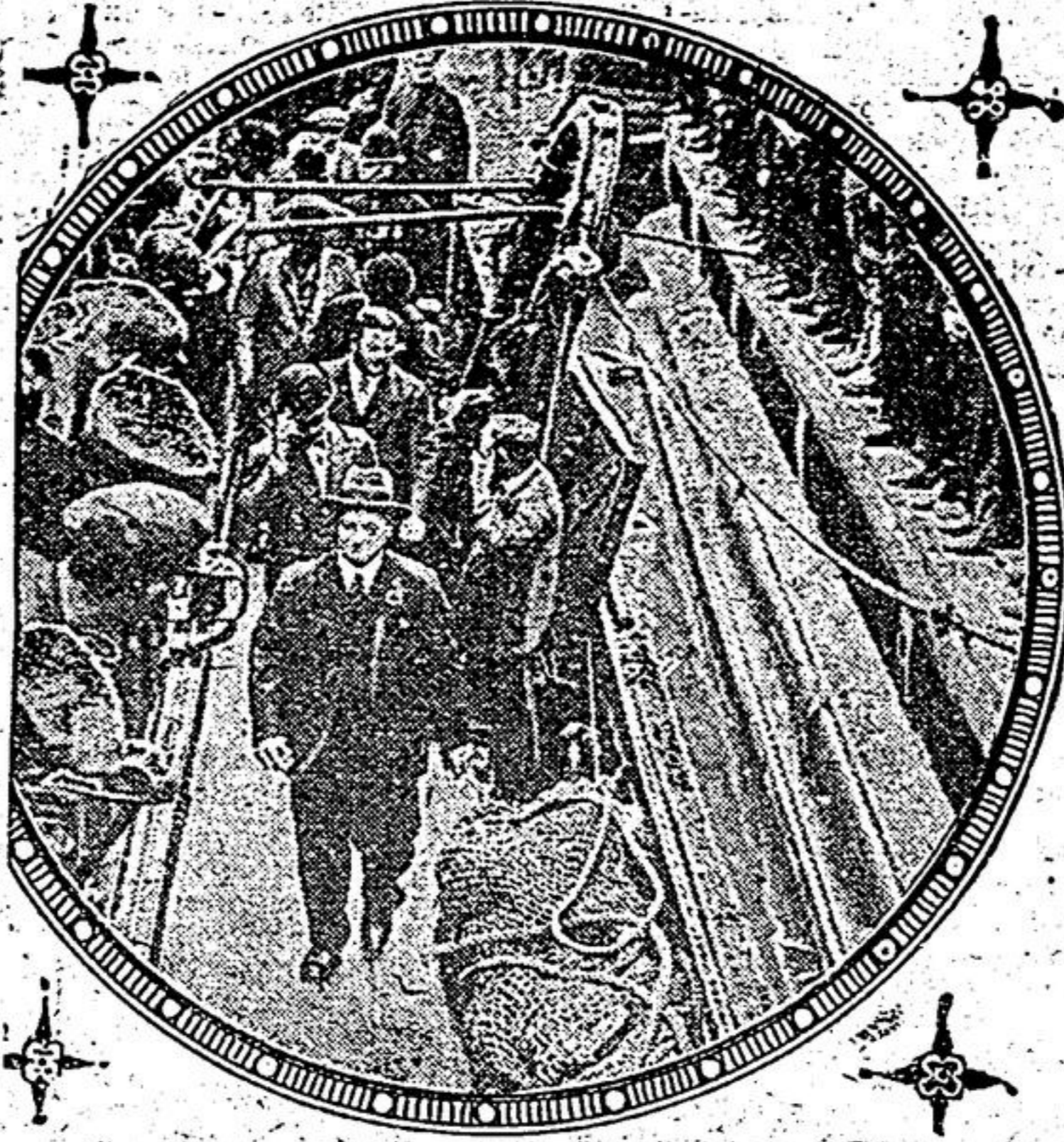
PRINCE OF WALES VISITS A FISHING TRAWLER

The heir to the throne during his visit to Grimsby as master of the merchant navy and fishing fleet.