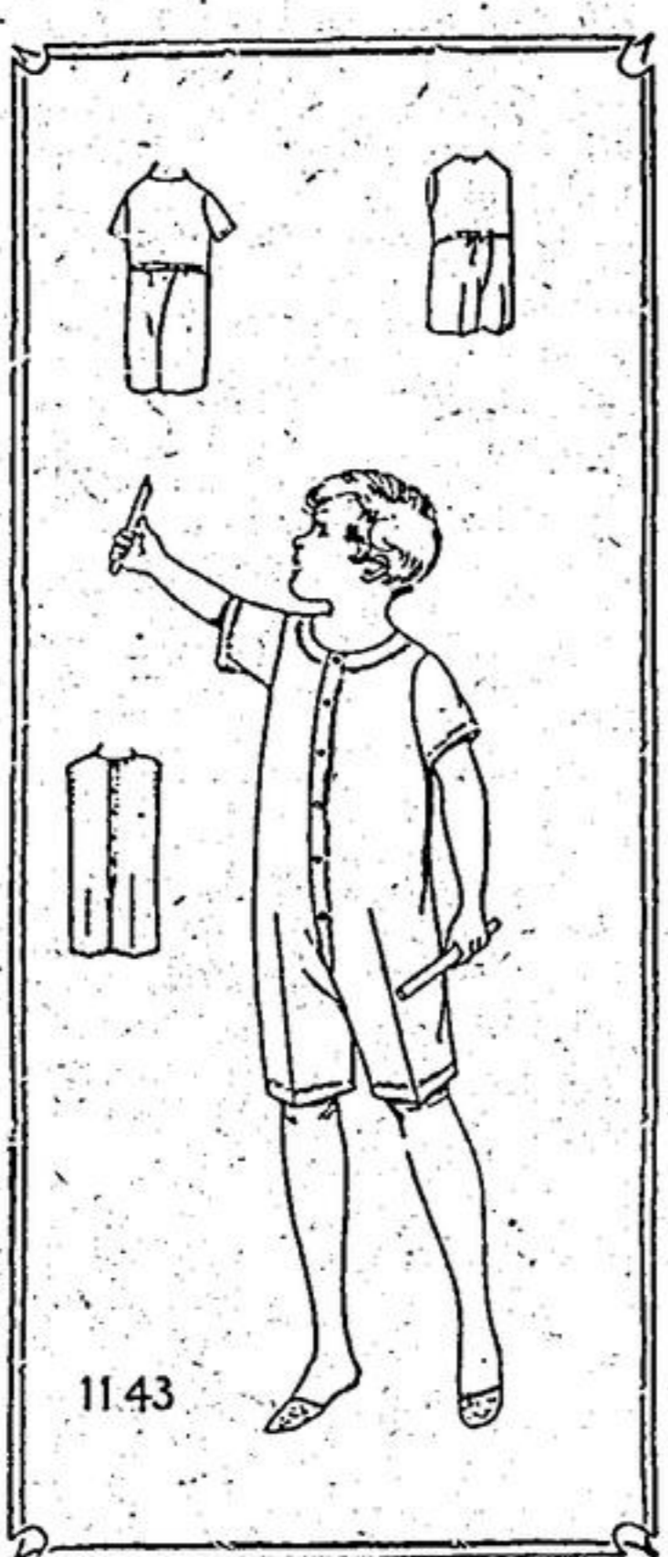
Boys' Union Suit

Any boy from eight to sixteen years of age will feel comfortable during the warm weather, if wearing the athletic garment pictured here. It is an exact copy of the kind worn by "Dad," which will be sufficient recommendation of its worthiness. Nainsook or soft nainsook would be suitable material. Pattern No. 1143 is cut mother-length and buttons down the front. The short sleeves may be omitted if desired and the armholes faced. Cut in sizes 8, 10, 12, 14 and 16 years. Size 10 years requires 2 1/2 yards of material 27 inches wide. Price 20 cents.