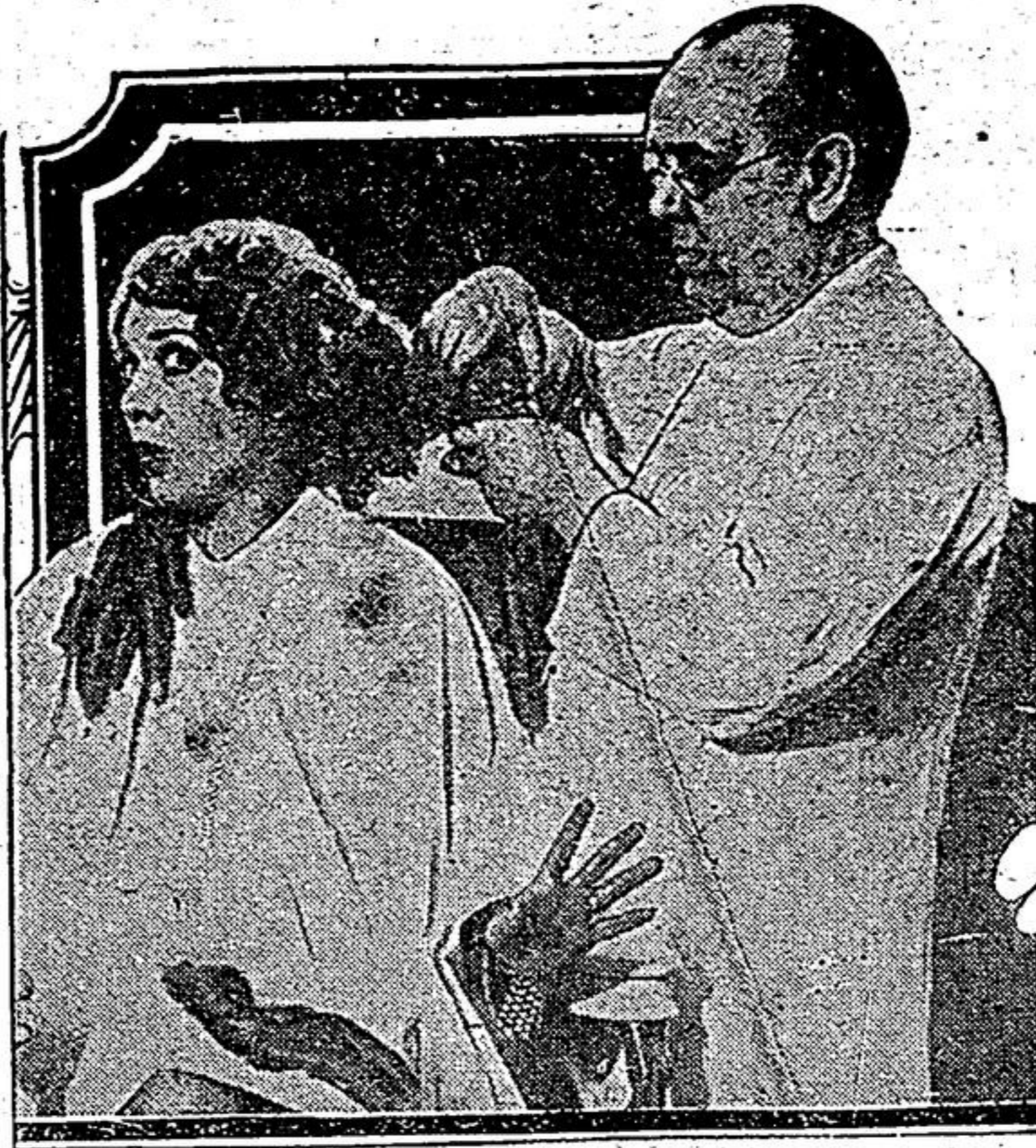
This shows the second operation on the universally known Pickford tresses. It was performed in Chicago a few days ago. The first cutting of the curls on the road to boddom was done in New York.