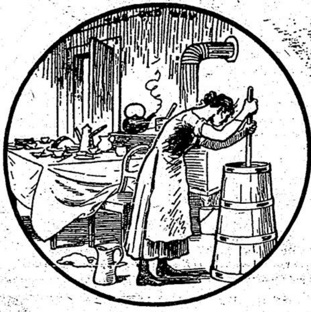
Ten Years Ago

Announcing the Tenth Anniversary of the Stouffville Creamery Company.