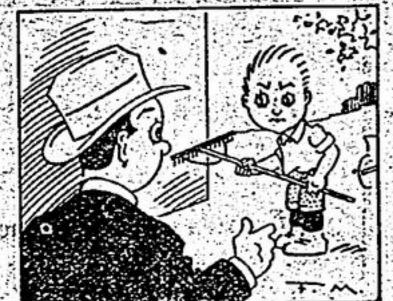
She Was At Home. Caller: "Young man, is your mother at home?" Willie: "Say, I've think I'd rather be cleaning up this yard than out playing ball!"