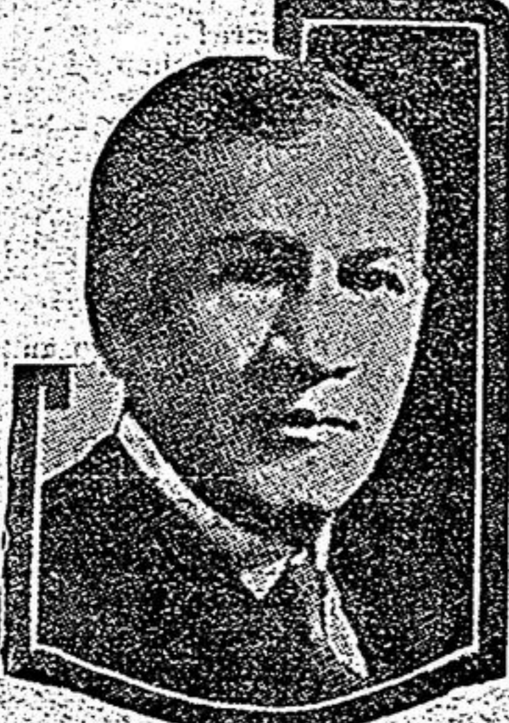
Sir William Duff Reid, Builder of the Newfoundland Railway, who died at his home in Montreal on March 12, in his fifty-sixth year.

ports were $30,266,920, an increase of over $1,000,000.