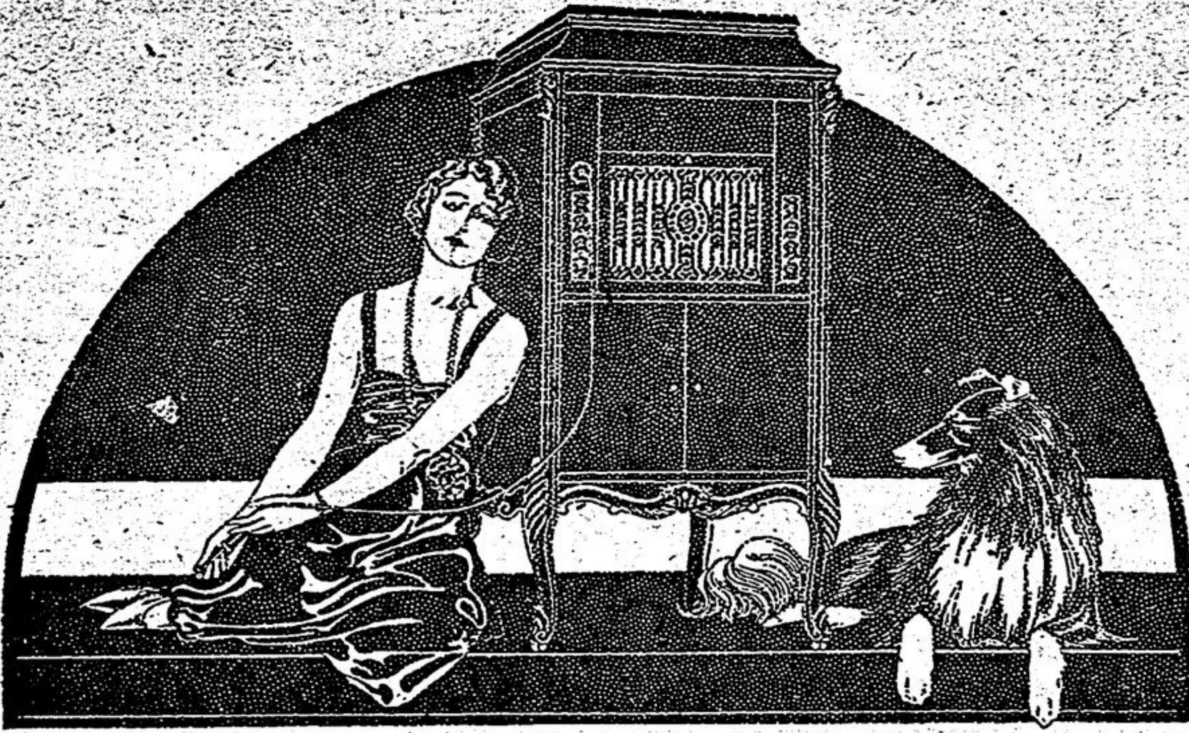
After you have seen a number of PHONOGRAPHS. Come in and look over our large and varied styles and models. If the BEST is good enough, we have it. SPECIAL THIS WEEK, 3 PACKAGES OF NEEDLES 25c.