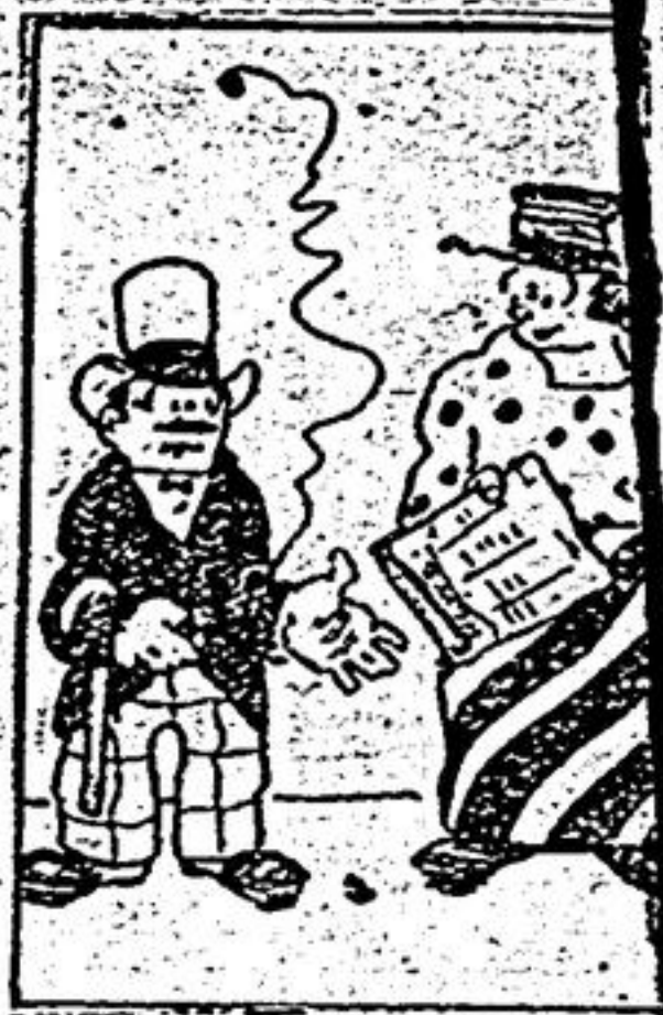
Doing His Part.

"The papers say there would panics if people only had confidence in the banks."