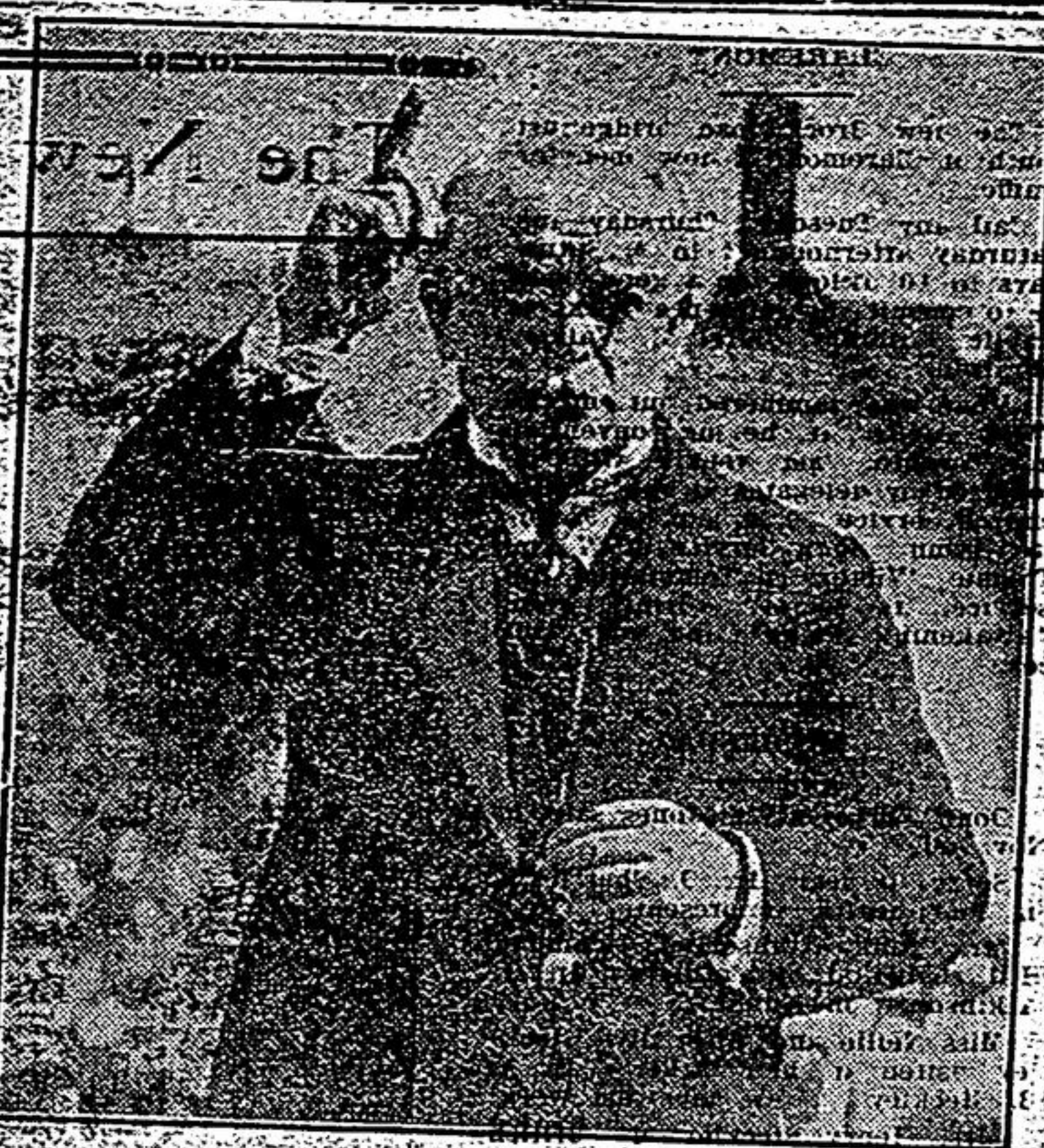
LLOYD GEORGE IN A FIGHTING MOOD. The Welsh wizard again astonished his critics by his attitude he has adopted toward the political situation. He is turning the election demands of his opponents to his own use. His Manchester speech fore shadows an appeal to the country.

London, Sept. 21.—The resignation of David Lloyd George, after having handed the resignation of the Government to His Majesty, through the King's seven critical years, resigned on Thursday. A new ministry will be formed. At the same time Lloyd George, it is understood, advised the King to send for Bonar Law to form a new Government. Bonar Law had led the Coalition Government with him into retirement, when the Unionist party, at a meeting held at the Carlton Club, voted 286 to 87 against the proposal of Austen Chamberlain, the Unionist party to remain in the Coalition and favoring a general election to confirm that course. The Coalition Government, however, was not to be dissolved. The Coalition Government, however, was not to be dissolved. The Coalition Government, however, was not to be dissolved.