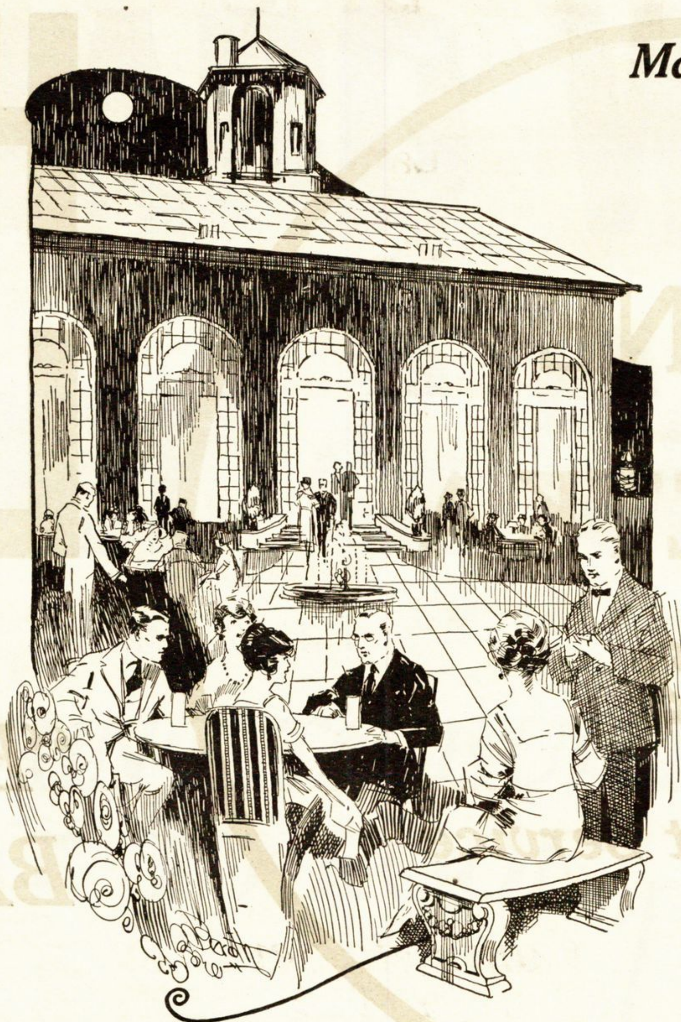
Looking toward the ball room from the south roof garden. Refreshments will be served out-of-doors during the summer months.

WITH its unequalled facilities for entertainment The Orrington assures a most enjoyable measure of happy times for its guests.