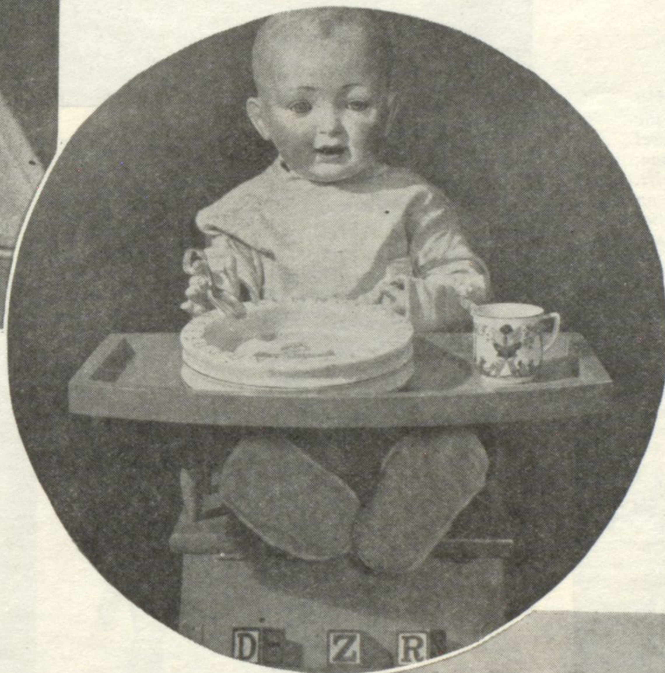
Right—When baby eats he will be happy with this "A B C" dish with nursery decoration, $1.25, and a generous sized cup for his milk, 35c.