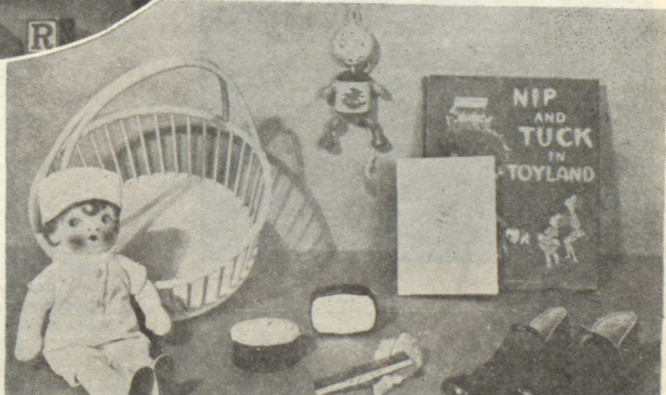
A reed baby basket to hold all of baby's things, $2.95—and a little dressing set of brush, comb, soap dish and powder box is $1.95. Moire covered baby book, $1.25. Red leather slippers with soft soles, $3.00. Nip and Tuck, $2.50.

FROM BABY'S OWN SPECIAL SECTION IN THE WEST ROOM—SECOND FLOOR