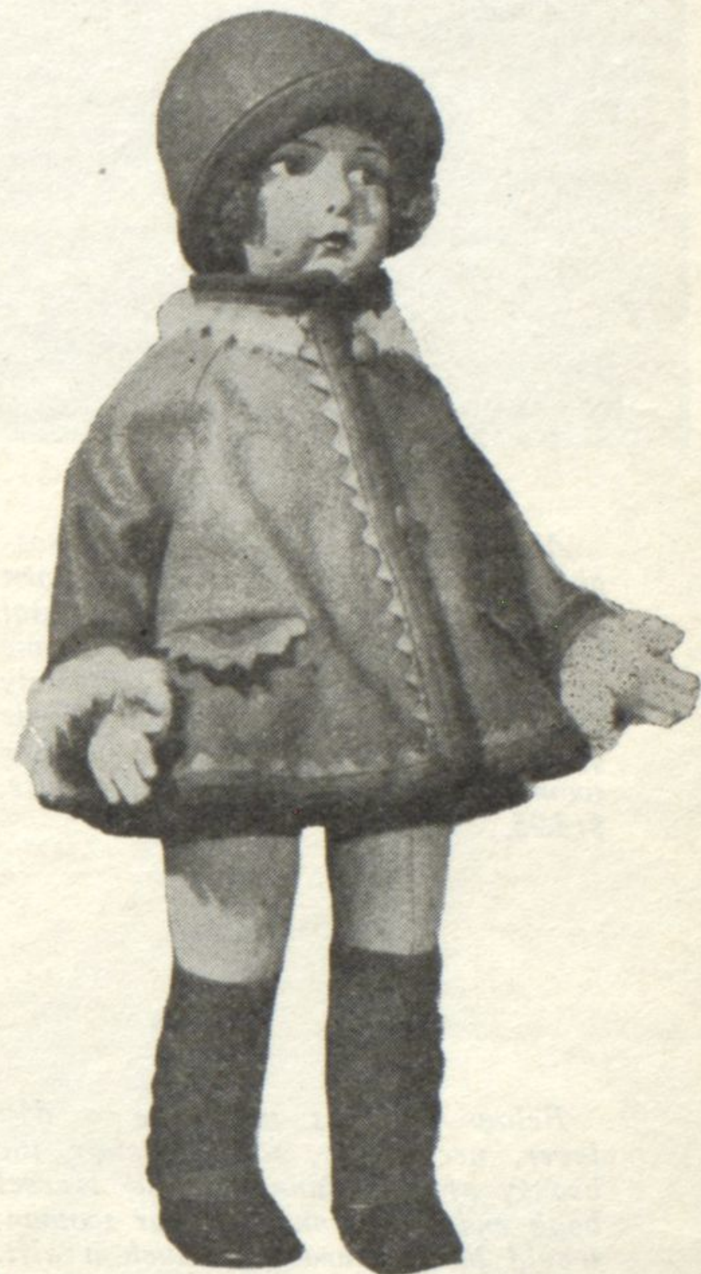
Above — "Miss Fashion" herself is this little Lenci coat-and-hat outfit from Italy. Designed of felt in youthful colors, $39.50.