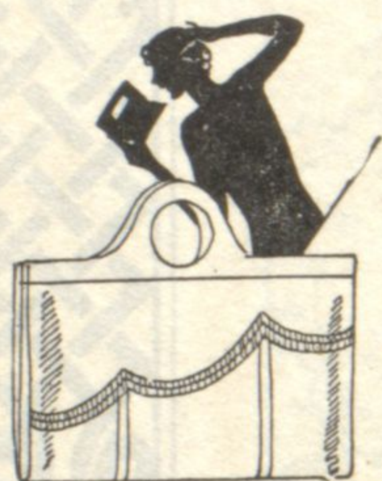
For Street or Evening $1.95 to $35.00