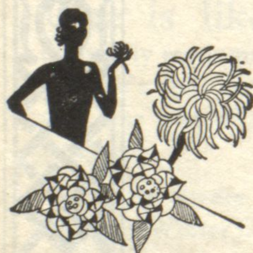
For Her Coat or Dress 50c to $5.00