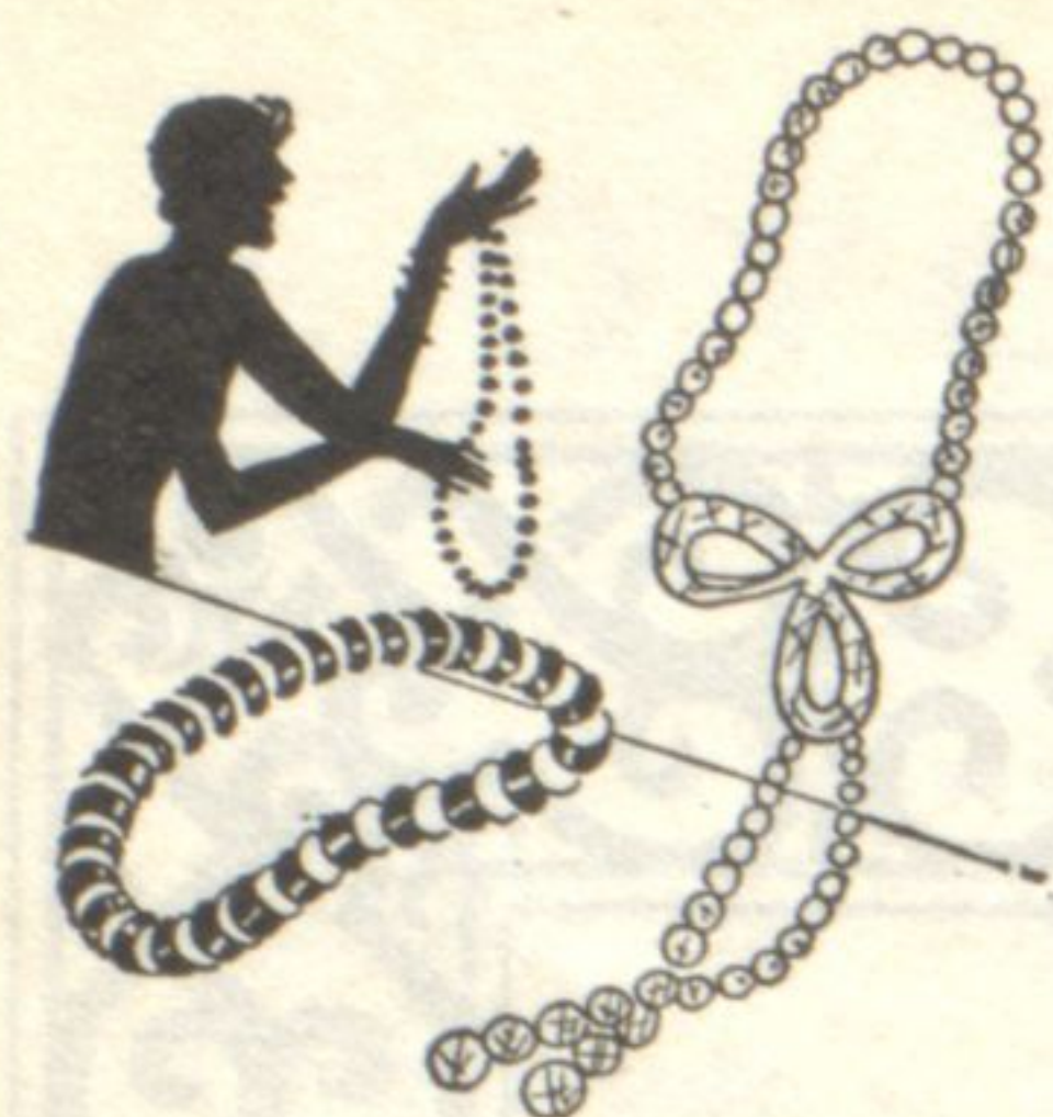
Of Gold or Pearls $1.25 to $35.00