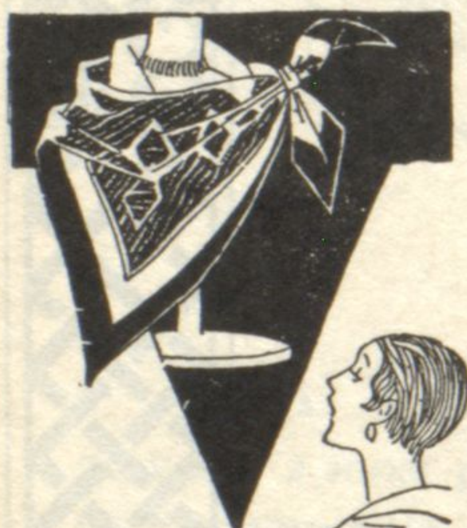
Hand Blocked $2.95 to $4.50