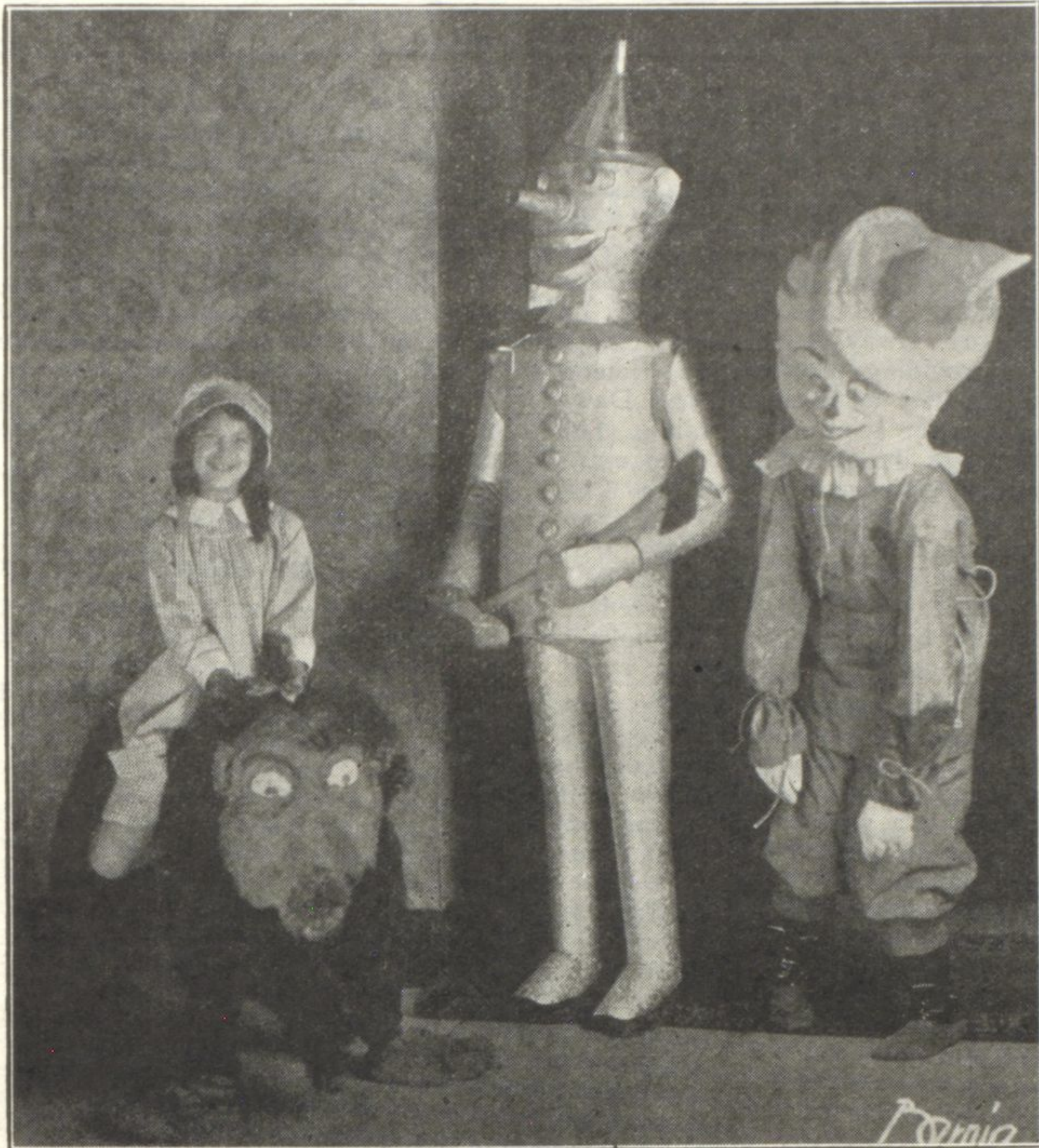
Pictured above are the three beloved characters, The Tin Woodman, The Scarecrow, and Dorothy, as they appear in "The Wizard of Oz" as presented by the Children's Theater of Evanston. They will make their bow to north shore children Wednesday afternoon, December 12, at 4 o'clock, at the Skokie School auditorium in Winnetka. The performance is a benefit for the new nursery school in Winnetka.