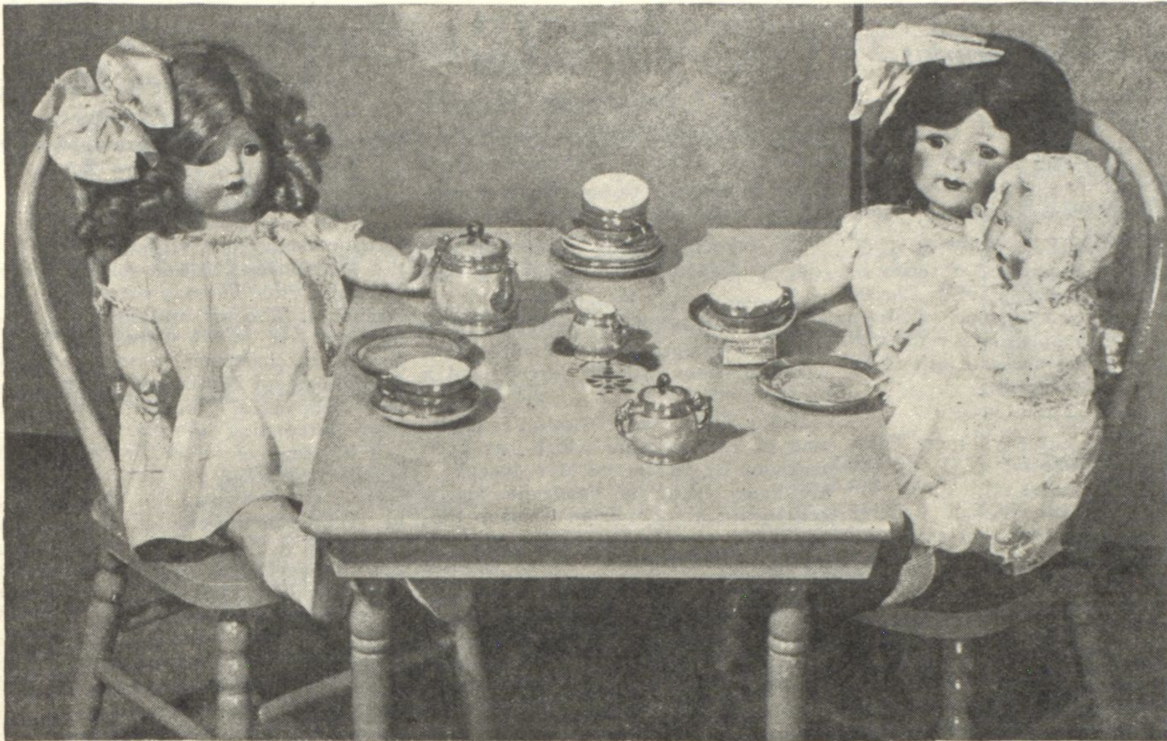
Left—Among those present at this delightful party were the appealing blond at the left in blue voile ($11.95), the equally charming titian beauty in pink voile ($9.95), adorable Bubbles in hand crocheted set ($9.95), the gold and luster tea set ($1.75), blue enameled table and chairs, ($6.50).

SANTA WANTS TO SEE THE LITTLE TOTS IN TOYLAND—THIRD FLOOR