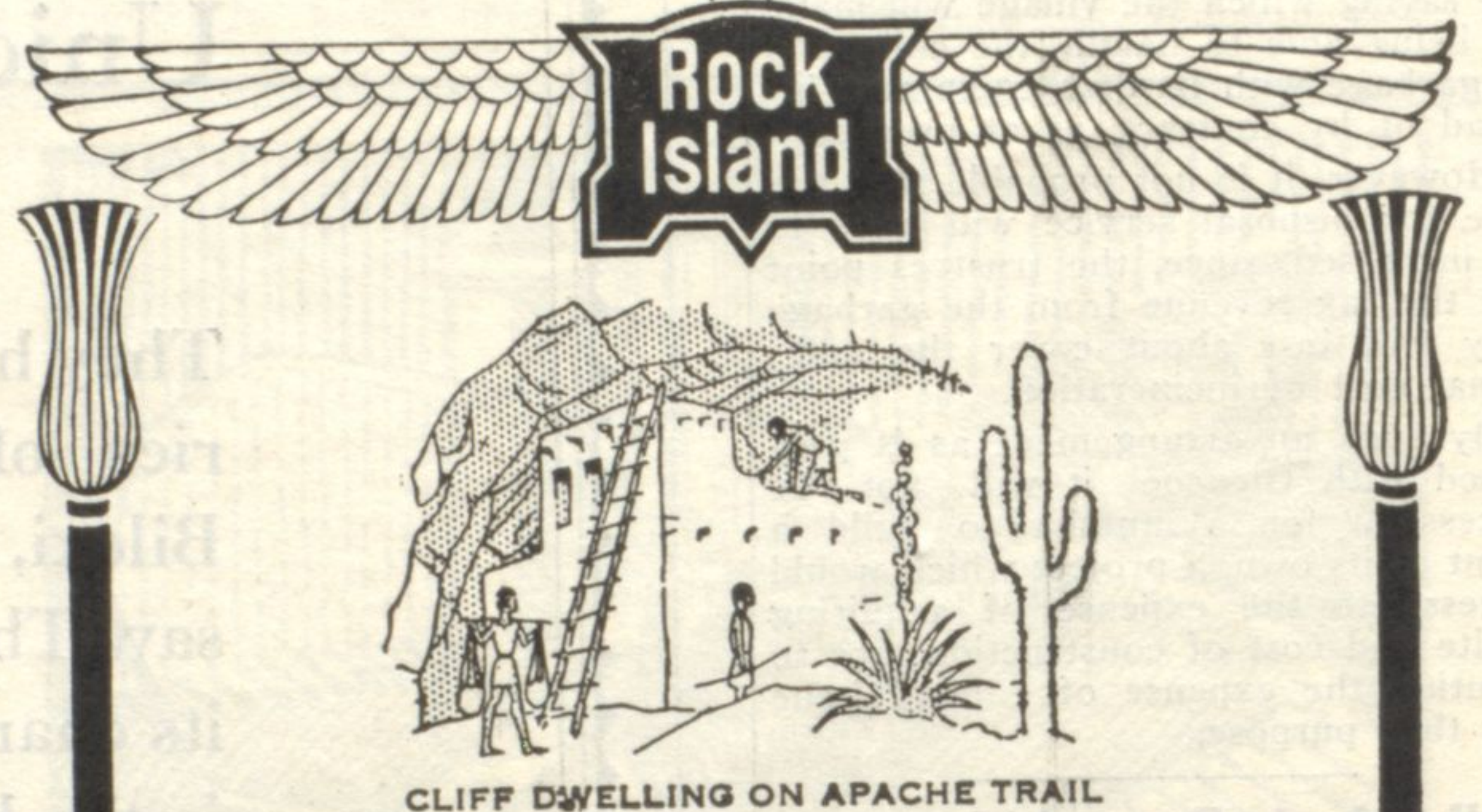
CLIFF DWELLING ON APACHE TRAIL