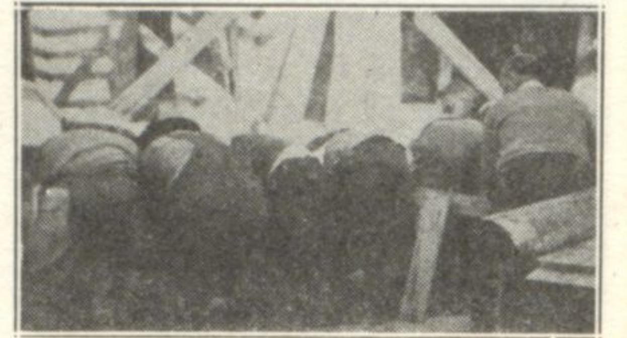
"Volunteers" ready to place a log in position.

An excellent well supplies an abundance of water, while Dame Nature has landscaped not only the five-acre tract on which the cabin is located but a vast area surrounding it, in a most appropriate wild, woodsy fashion, which will not only appeal to the fancy of youthful hikers and campers, but to the older ones who seek a quiet, restful day in the woods.