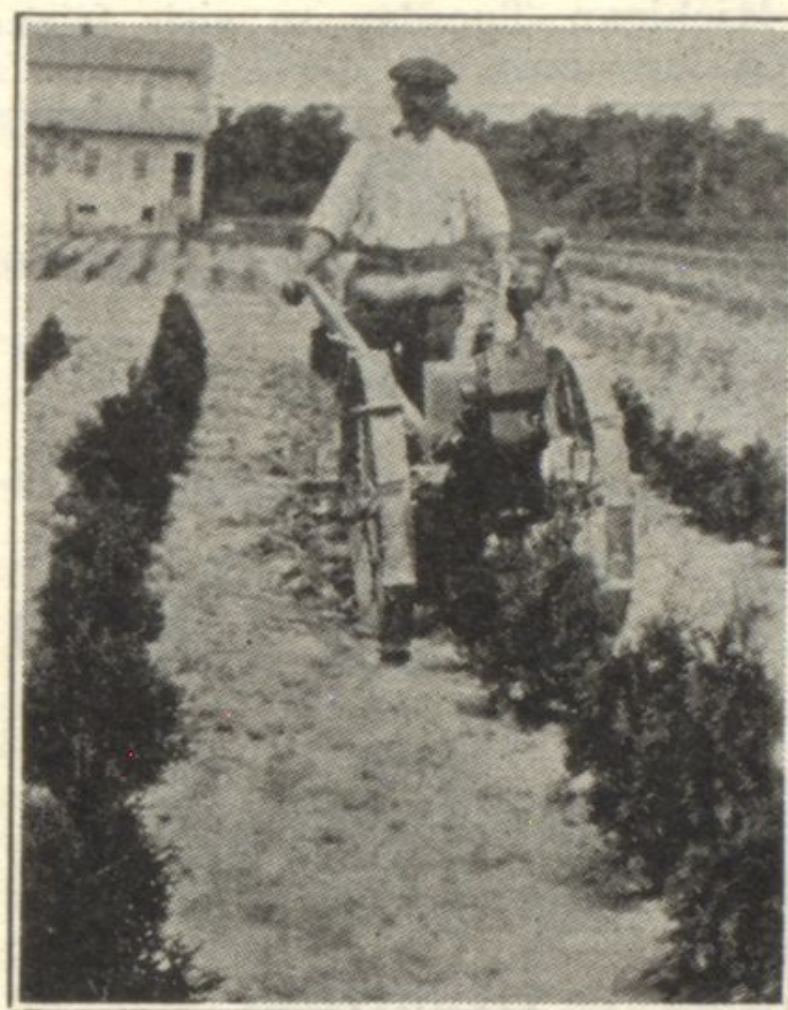
Cultivating Arbor Vitae Evergreens

3 Miles W. of Waukegan Rd. Telephone On DUNDEE ROAD Northbrook 230R1