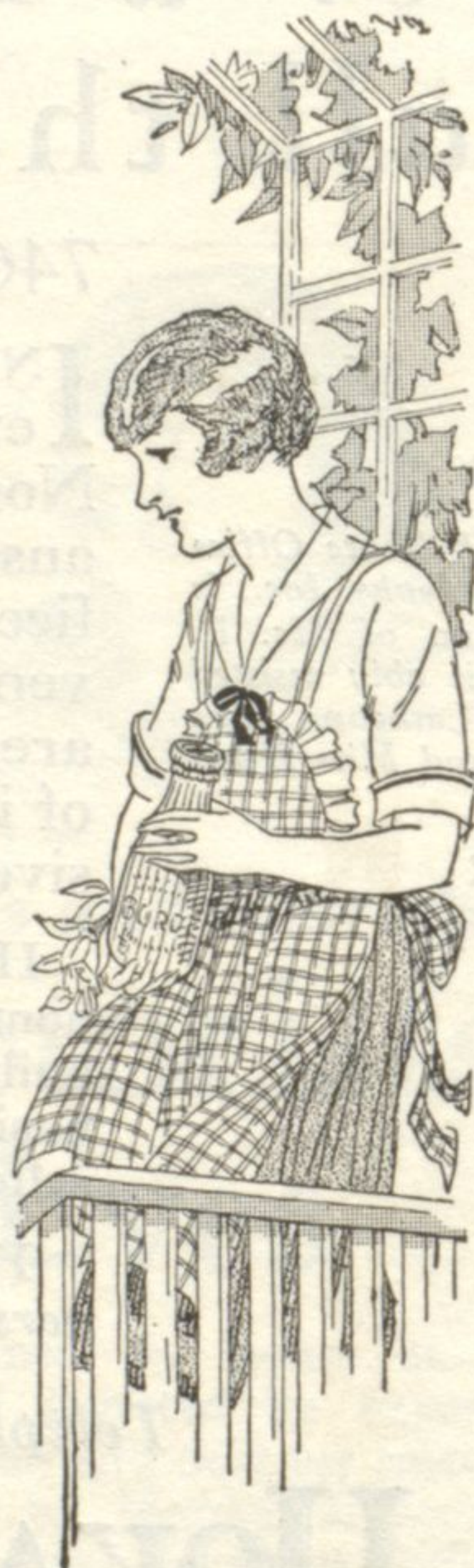
1 7/8 a Quart