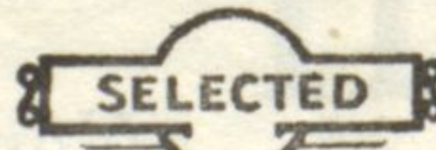
Identified by this trade mark on the hooded cap