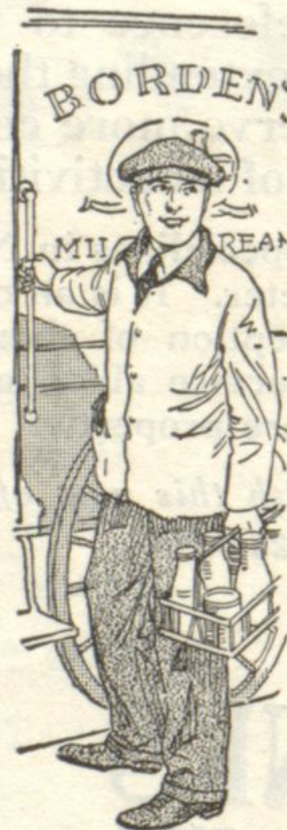
You'll like Borden's Cream, too. Has a mild, pleasing flavor and keeps sweet.

Compare the Sweet Natural Taste of "Selected" and you will understand why many families are changing to this better drinking milk.