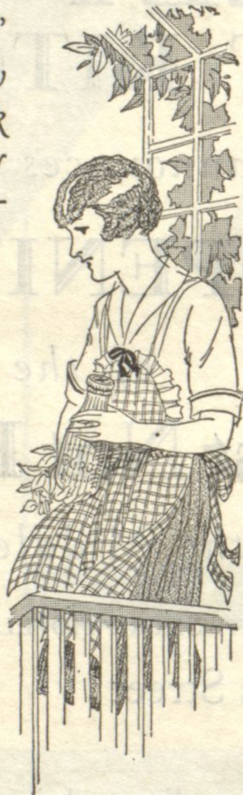
17¢ a Quart

The Borden Milkman can refer you to families in your block who enjoy "Selected" Milk and know from experience how excellent it is.