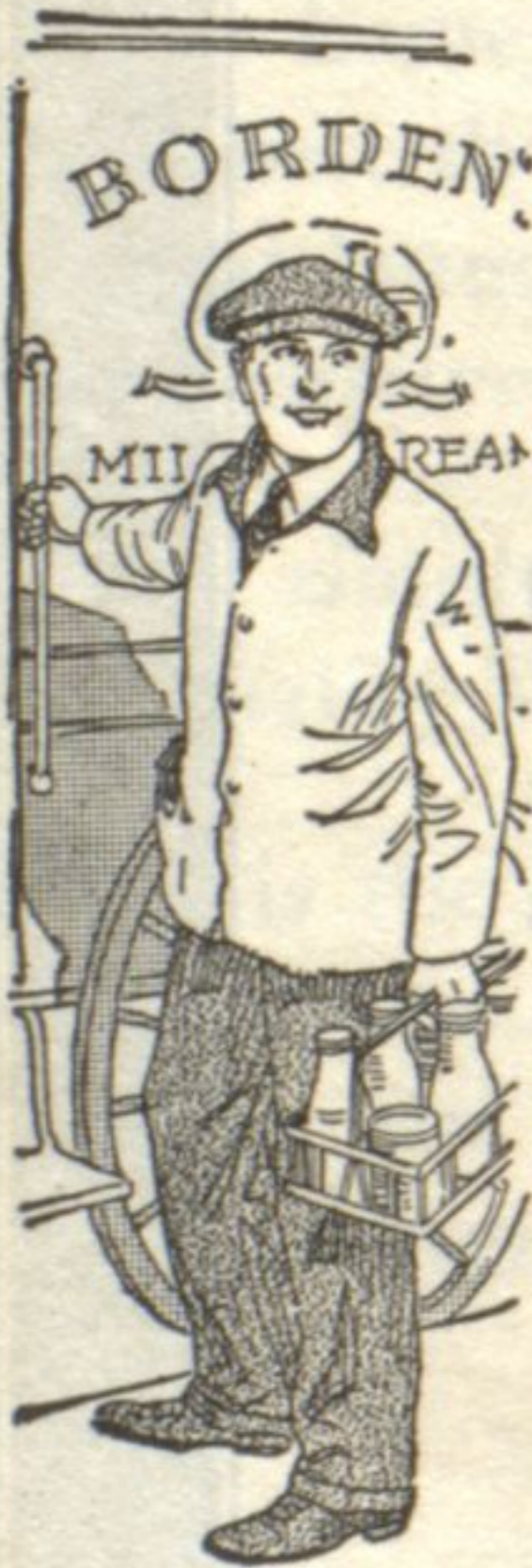
Remember the Borden milkman carries cream, butter, eggs, cottage cheese, soured cream—18 good foods in all.

You'll always be glad you changed to "Selected"—and it's easy to change: (1) Mark your Borden's Milk Card. (2) Phone Franklin 3110 or nearest Borden Branch. (3) Speak to any Borden Milkman.