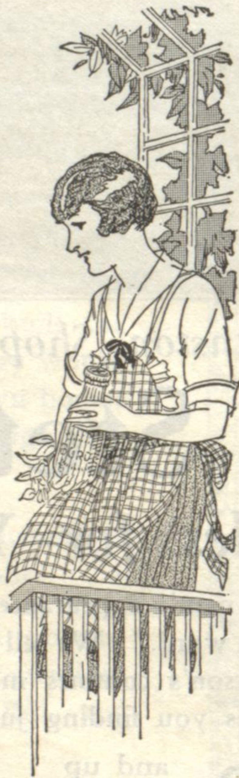
17¢ a Quart