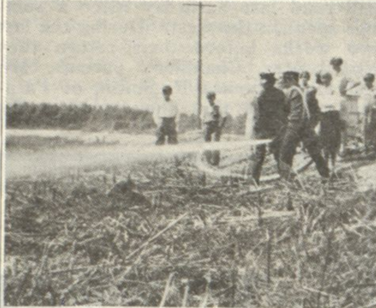
Reclaiming another section of the Skokie, out at the west extremity of Tower Road, Winnetka. In the upper picture is a veritable prairie fire, but under control, thank you. In the view to the left, cleared some time ago, the Winnetka Fire department is seen extinguishing a Skokie "ground fire." More splendid new home sites are being carved out of this section.