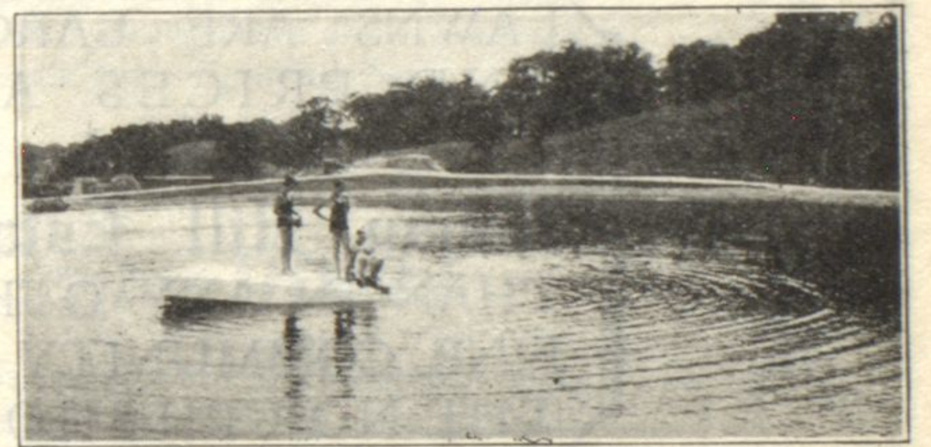
Two Spring-fed Lakes