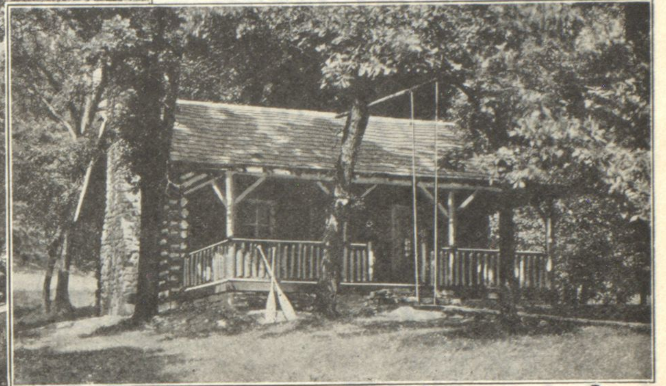
Less Than an Hour's Ride